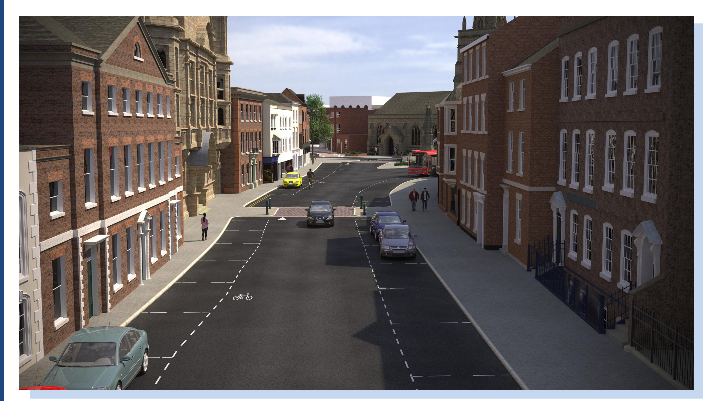
Informal cycle lane and raised crossing at Town Hall