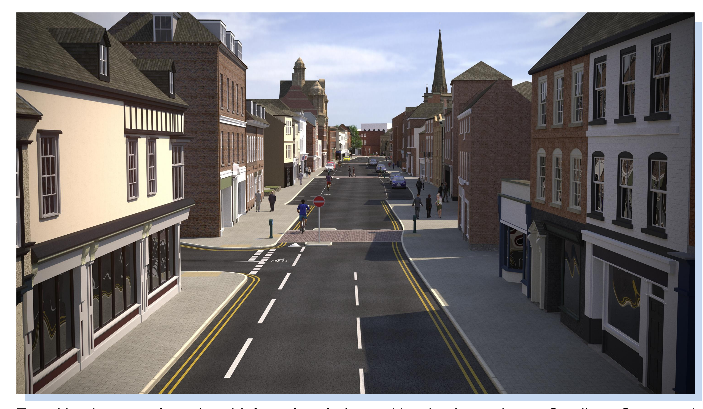
Transition between formal and informal cycle lane with raised crossing at Cantilupe Street and raised crossing at St Owens Mews beyond.