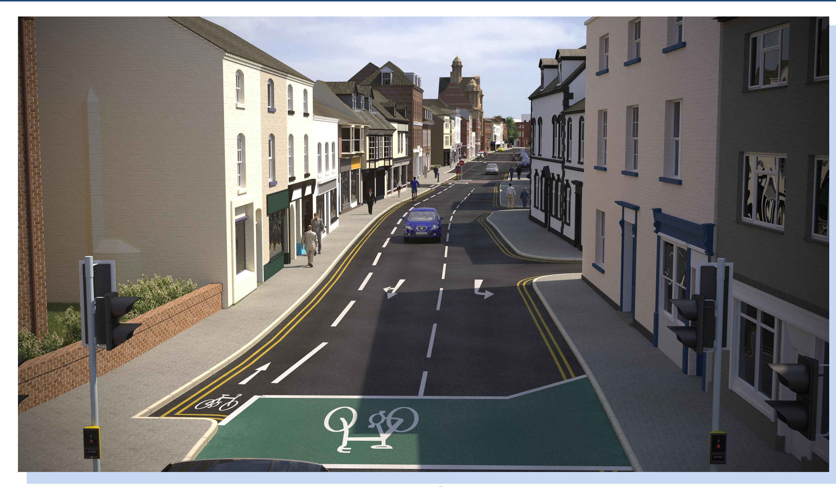
Formal cycle lane and controlled crossing at Bath Street Junction