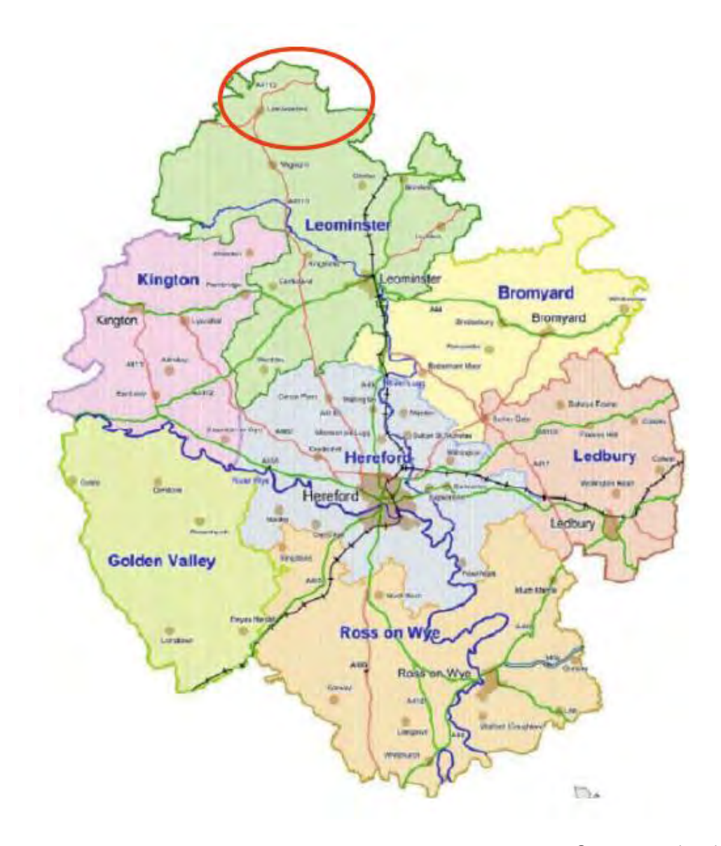
Figure 2 - Location of Leintwardine Group Parish within Leominster Housing Market Area.