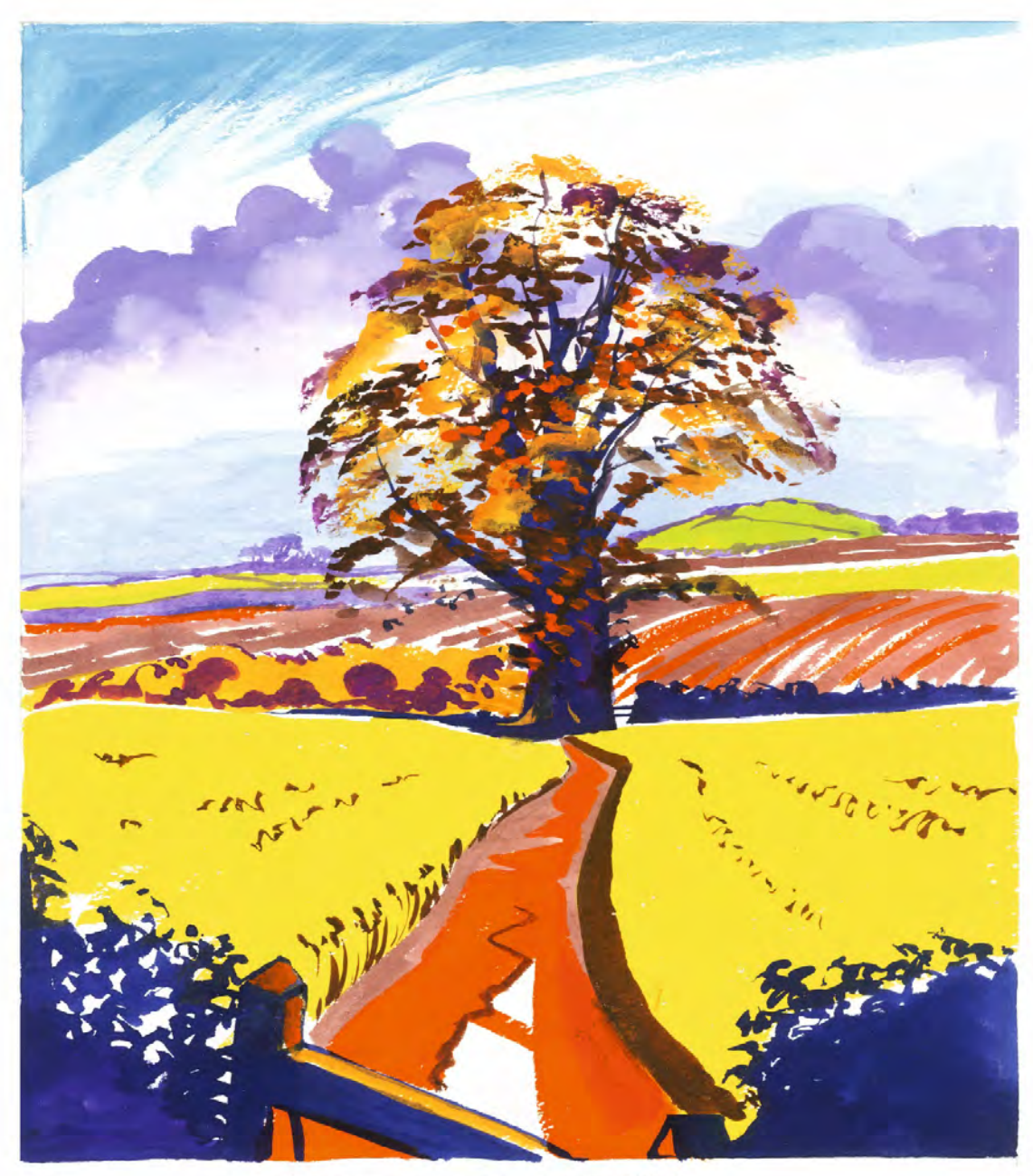
THE ANGENT EST EXPOSITION