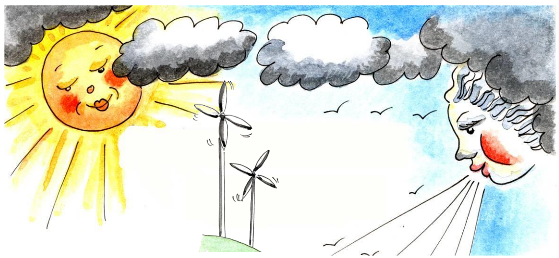
4e. Renewable Energy