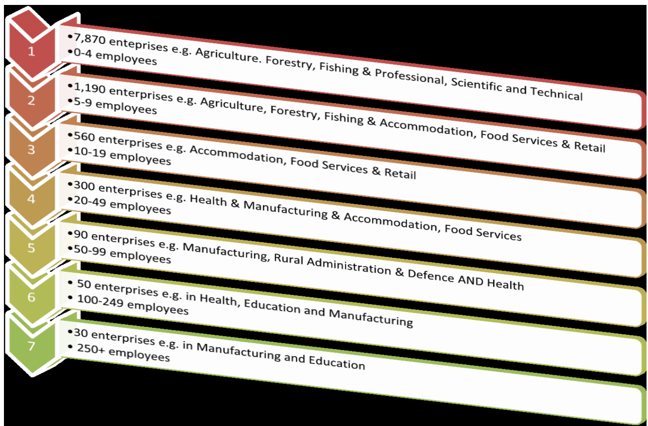
Fig 1 Business in Herefordshire by size, type and employee numbers