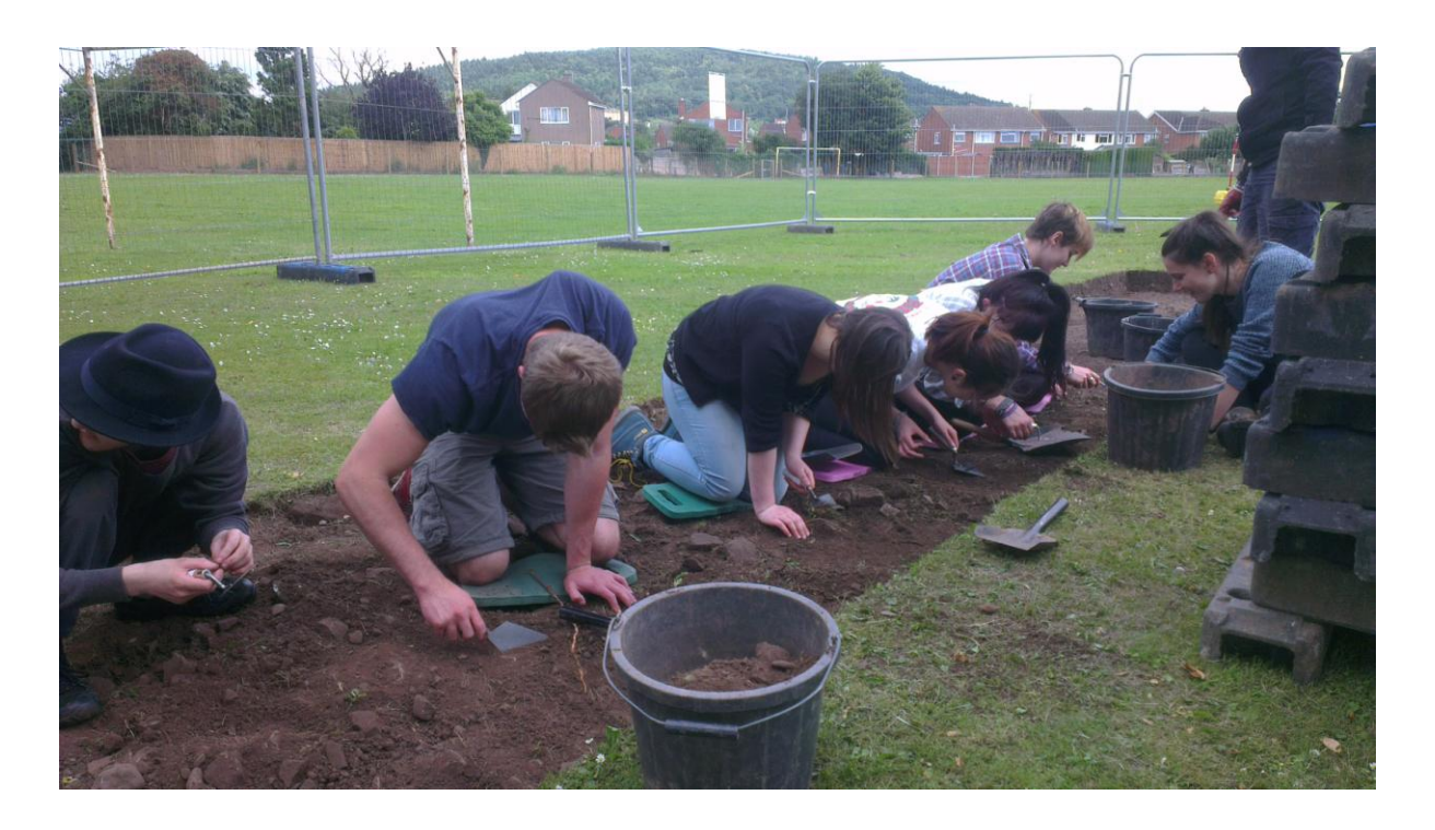
Hereford Sixth Form College students hard at work.

Progress has been gradual for the first week as we search for the walls and hopefully the floors that remain in place beneath the building rubble. Watch this space for further updates and images of the artefacts discovered.