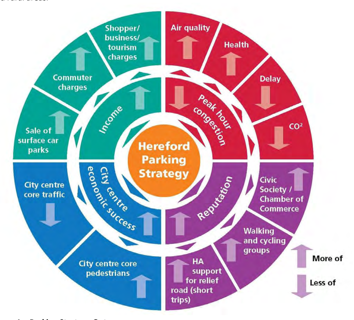
Figure 1 – Parking Strategy Outcomes

This strategy acknowledges that car travel is the most important form of transport in what is one of the most rural counties in England and that parking issues are very different in different parts of the county. A particular challenge in the development of this strategy is to support the regeneration of Hereford city centre, balancing the competing demands for a sufficient supply of parking for commuter, retail, leisure, tourist and business needs whilst keeping congestion and its related problems in check. Clearly our approach for Hereford varies considerably to that in the market towns and rural areas.