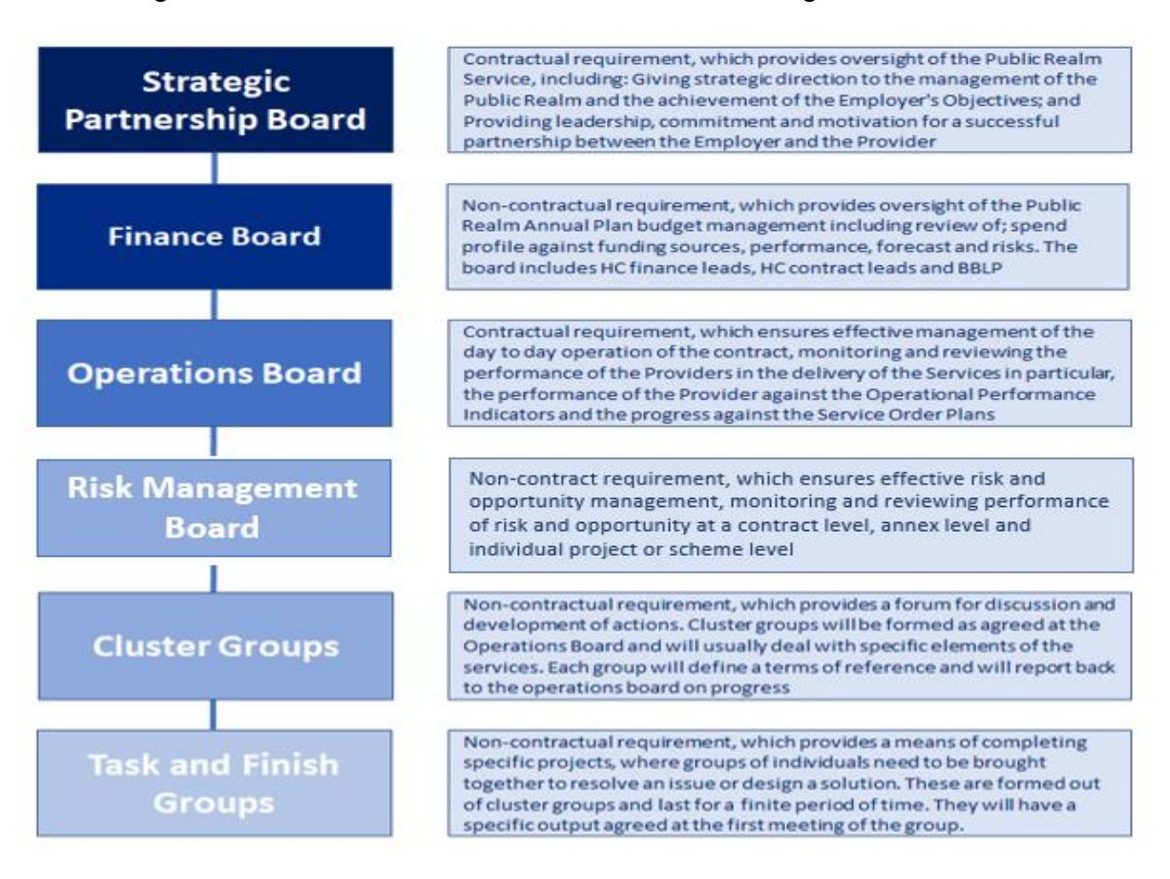
Figure 1: Formal Governance Structures

The formal governance mechanisms of the contract are set out in Figure 1.