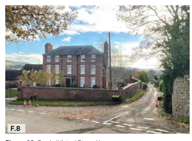
Figure 08: Grade II listed Stone House.