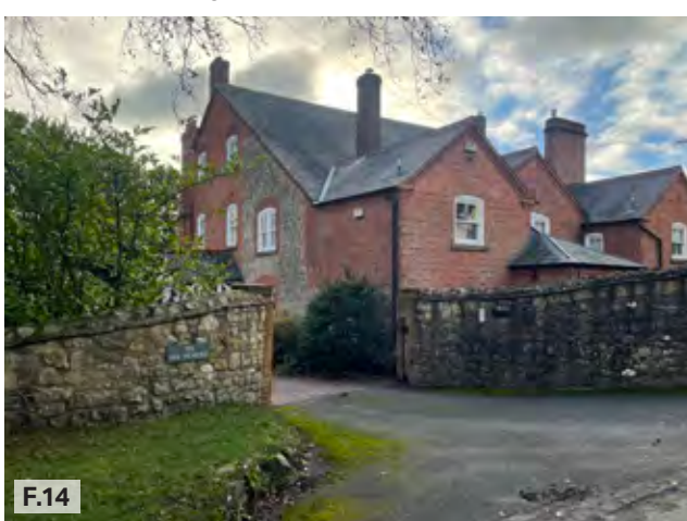
Figure 14: Further examples of red brick and stone can be seen throughout the village.