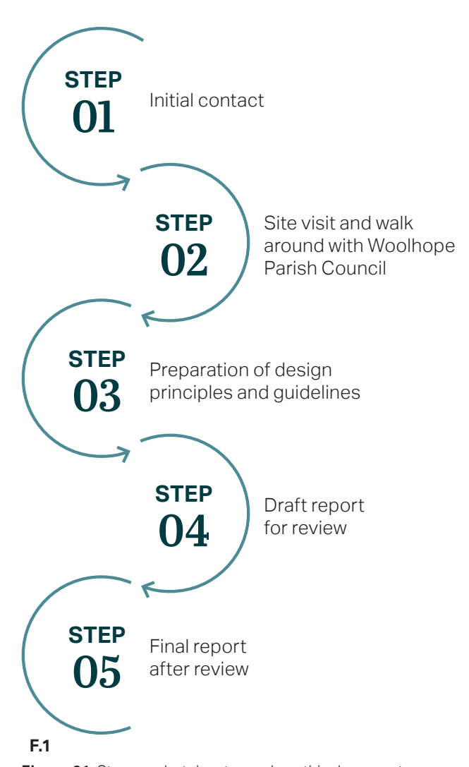
Figure 01: Steps undertaken to produce this document

The Design Code is intended to sit alongside the Neighbourhood Plan to provide guidance for applicants preparing proposals in the area, as a guide for the Parish Council when making comments on planning proposals and applications, and for Herefordshire Council when considering and making decisions on planning applications. It sets out the expectations for proposals and ensures that they will reflect Woolhope's key defining characteristics.