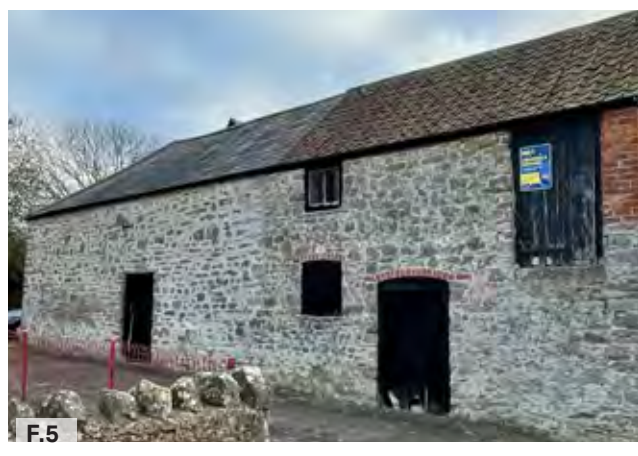
Figure 05: Stone barns are located throughout the parish.