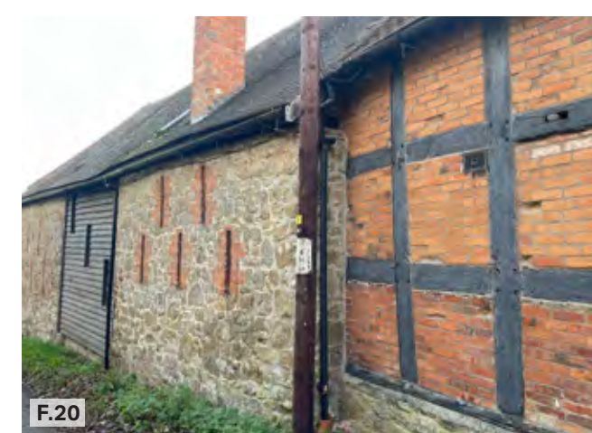
Figure 20: Medieval barn in the countryside leaving Woolhope towards The Nurdens.