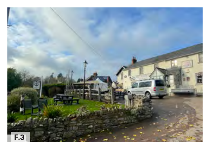
Figure 03: The Crown Inn.

Woolhope has a strong social and communal atmosphere. The village is host to two pubs, The Crown Inn and The Butchers Arms. There is also Woolhope Village Hall located by Berryfield sport and recreation area which hosts theatre productions and village events.