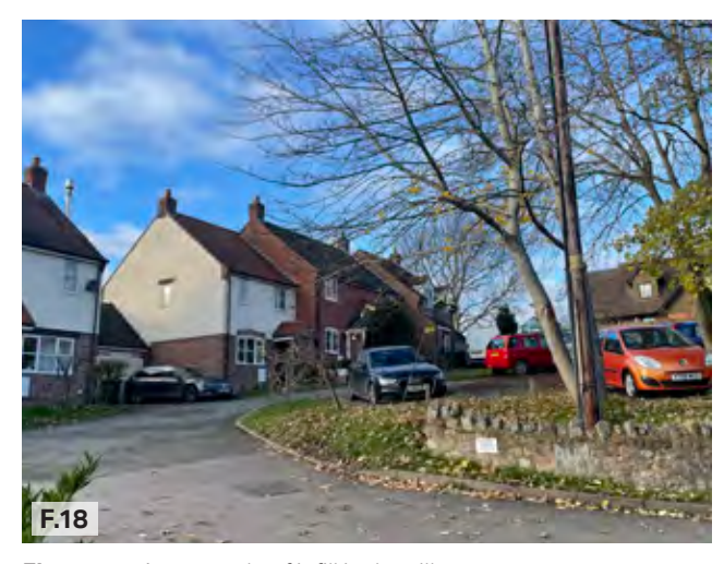
Figure 18: An example of infill in the village.