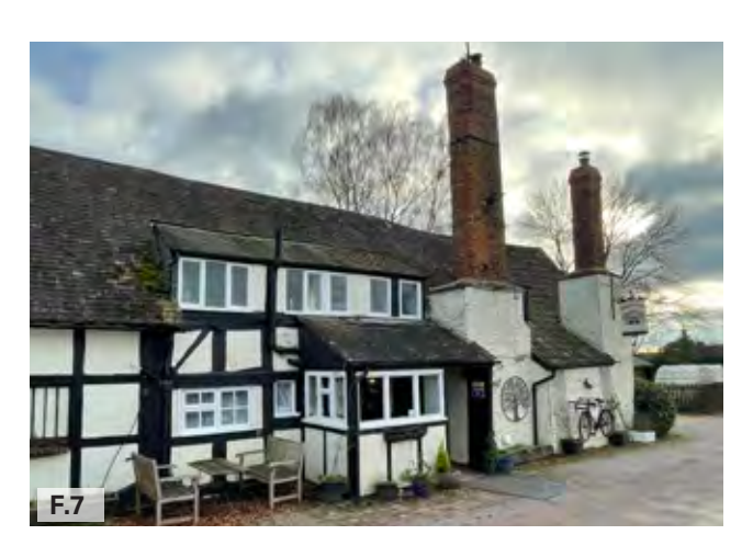
Figure 07: Grade II listed Butcher's Arms.

The parish has several other Grade II listed assets such as The Old Vicarage, The Stone House, The Court, and The Butcher's Arms. These date from C17 to C19.