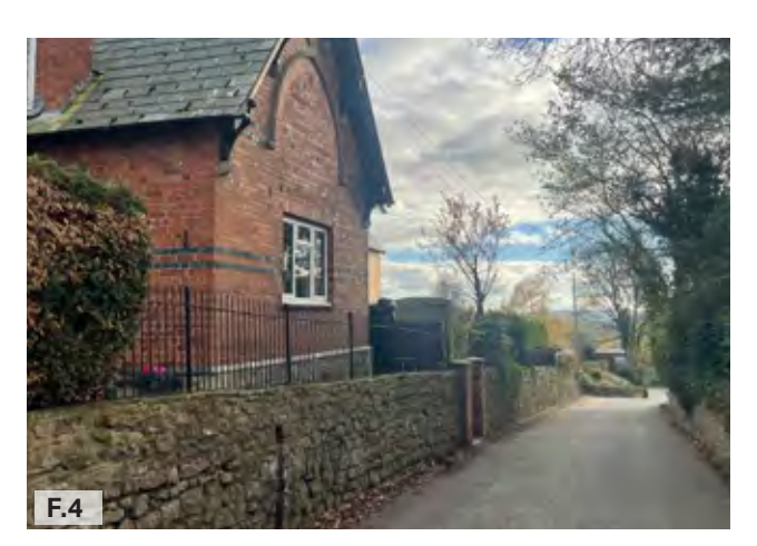
Figure 04: Martins Close.