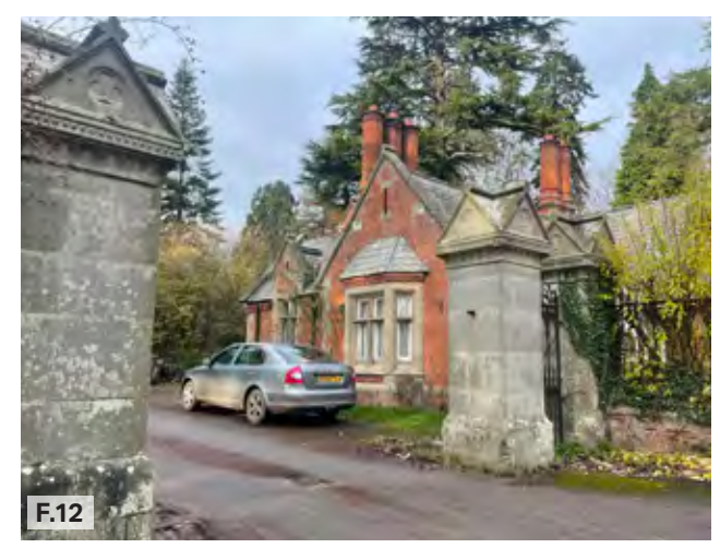
Figure 12: Lodge at entrance to former estate parklands of Wessington Court.