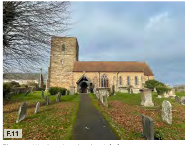
Figure 11: Woolhope's parish church St George's.