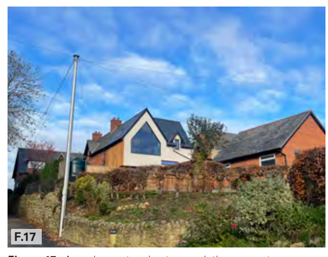
Figure 17: A modern extension to an existing property.