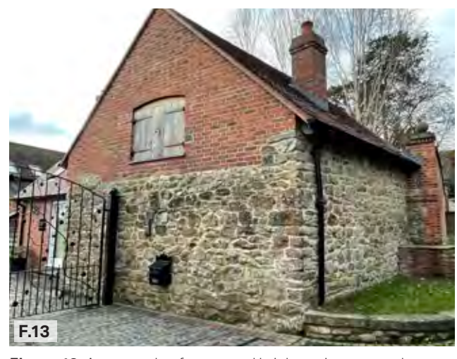
Figure 13: An example of stone and brick, a mix commonly seen where older buildings have been extended or modified.