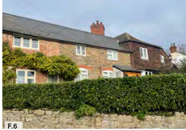
Figure 06: Terraced properties in the village.