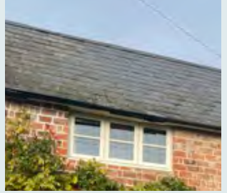
Grey slate roof