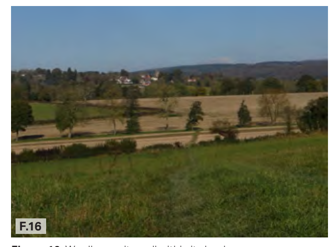
Figure 16: Woolhope sits well within its landscape.