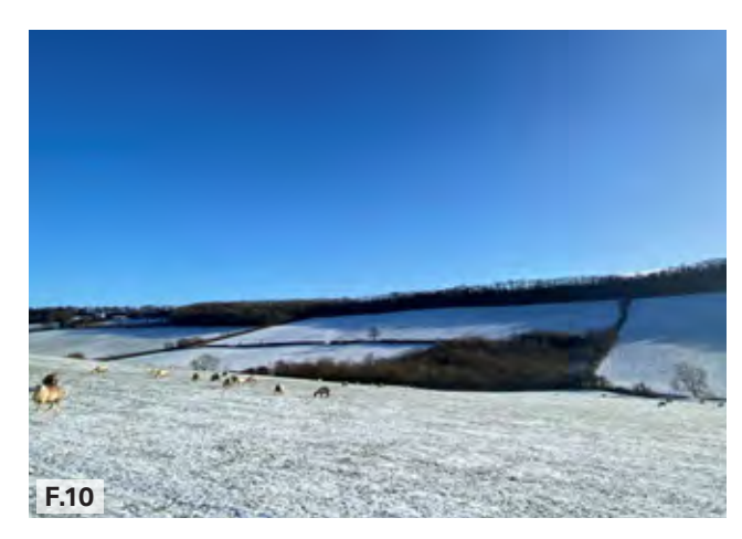
Figure 10: Typical rolling downland of the Woolhope Dome, with woods on the ridgelines and sheep grazing on hillside pastures.

The parish is also partially within the Wye Valley Area of Outstanding Natural Beauty which is home to dramatic limestone gorges, historic castles, and wildlife.