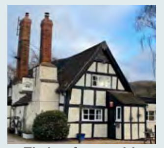
Timber frame with plaster infill