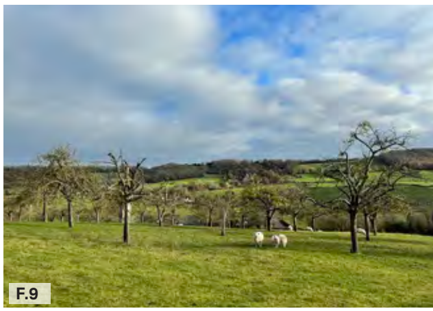
Figure 09: Orchard south of Woolhope Village with sheep grazing.