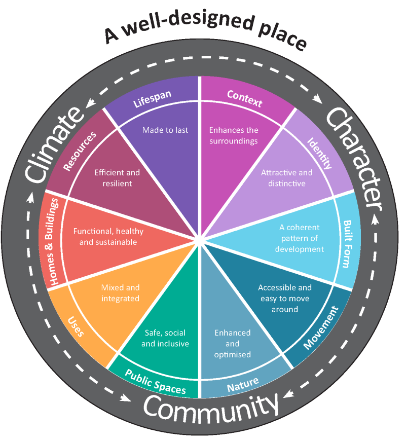
National Model Design Code -The 10 characteristics of well-designed places