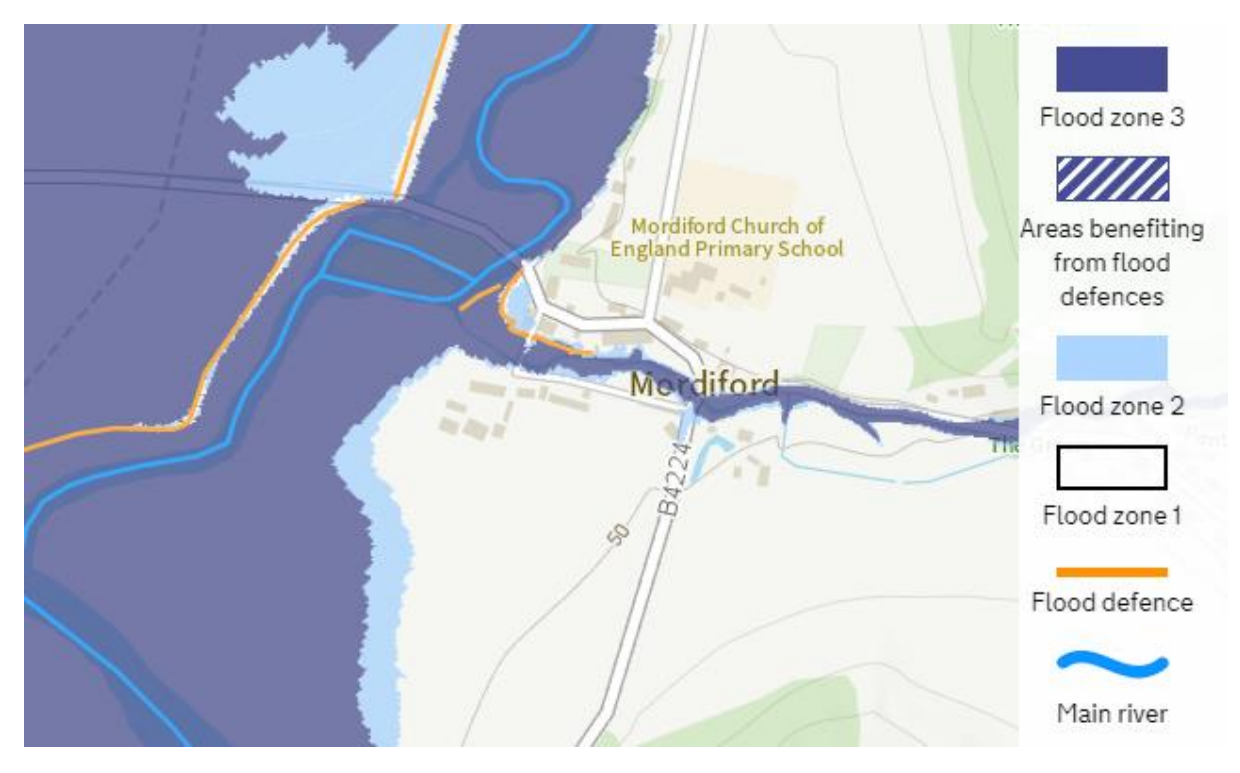
Figure 2: Environment Agency's Flood Map for Planning (Rivers and Sea), June 2021