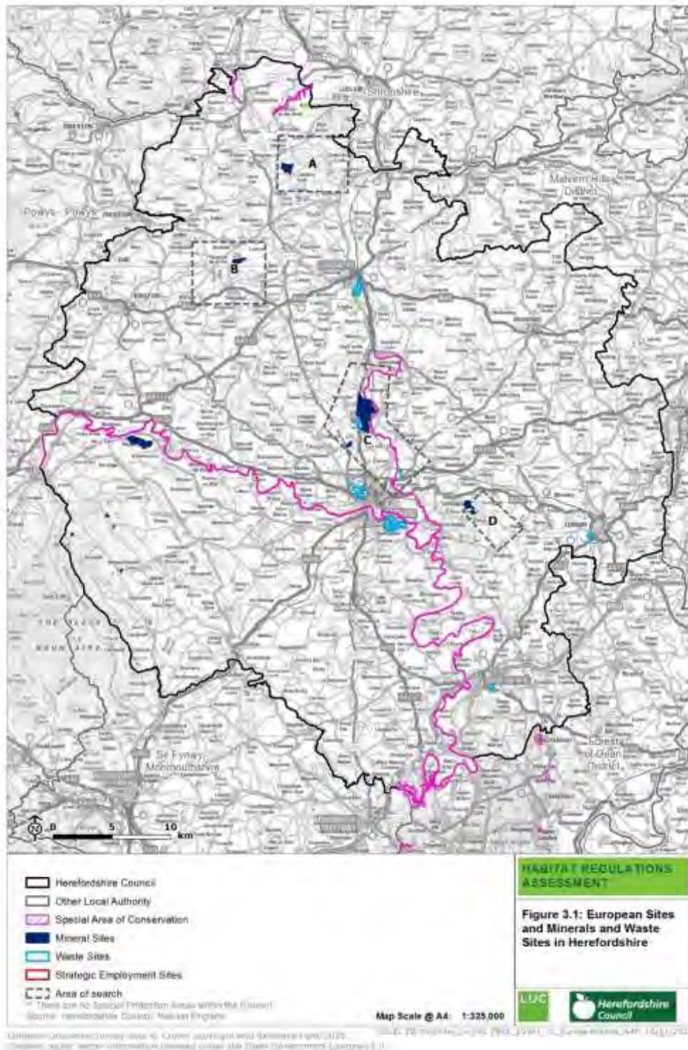
Figure 3.1: European Sites and Minerals and Waste Sites in Herefordshire