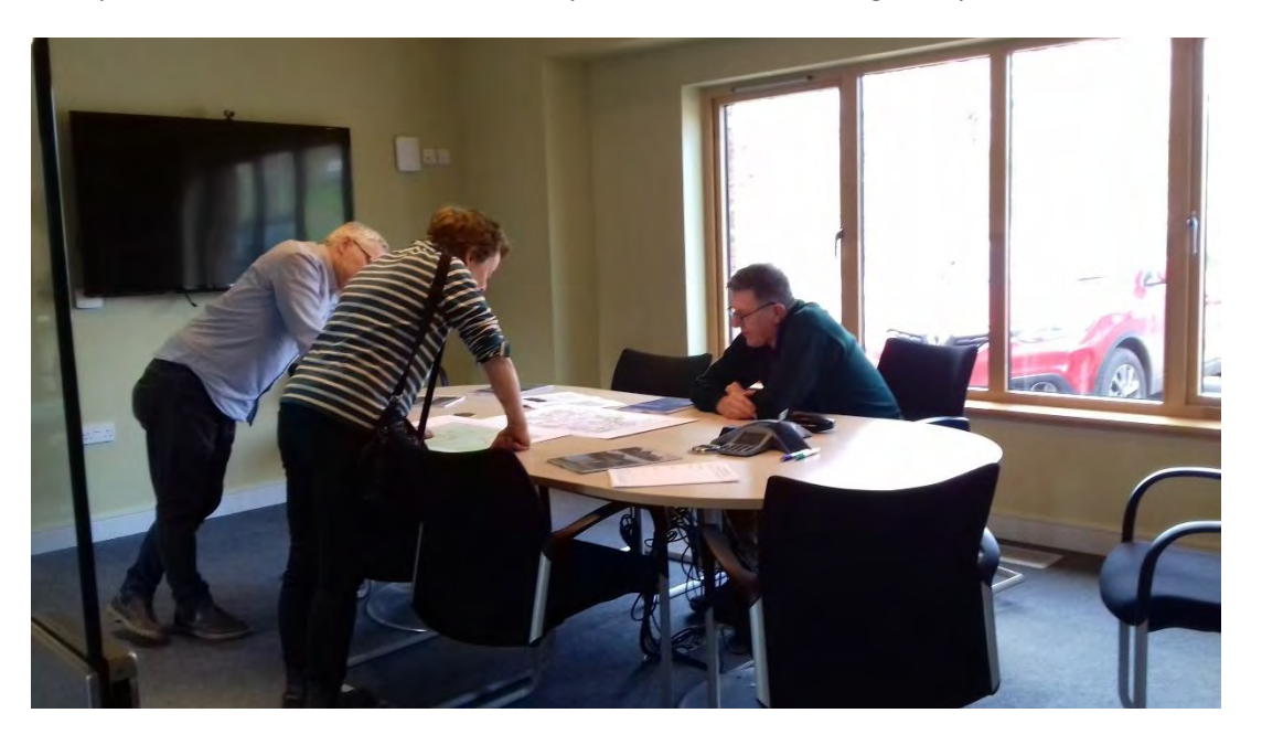
3 Residents discuss the settlement boundary options