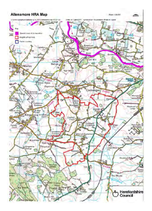
Figure 2 below highlights the location of the River Wye SAC in relation to the Allensmore neighbourhood area

4.1 The initial Screening report (26 July 2017) found that the Neighbourhood Area is in the hydrological catchment of the River Wye (including the River Lugg) SAC. Therefore a full screening assessment is required. The west of the Parish is in the hydrological catchment.