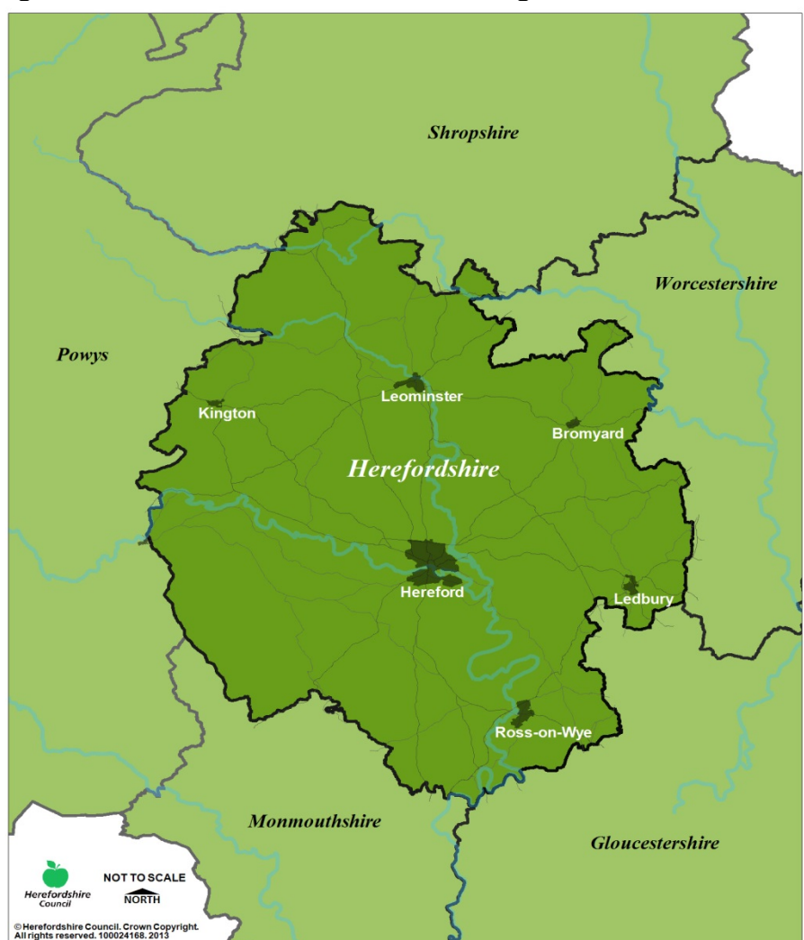
Figure 2.1 - Herefordshire and surrounding counties

2.3 Herefordshire is a large, predominately rural, landlocked county situated in the south western corner of the West Midlands region, on the border with Wales. It has a close relationship with neighbouring Shropshire and Worcestershire and there are a range of interactions taking place which cross Herefordshire's boundaries in all directions, including service provision, transport links and commuting patterns.