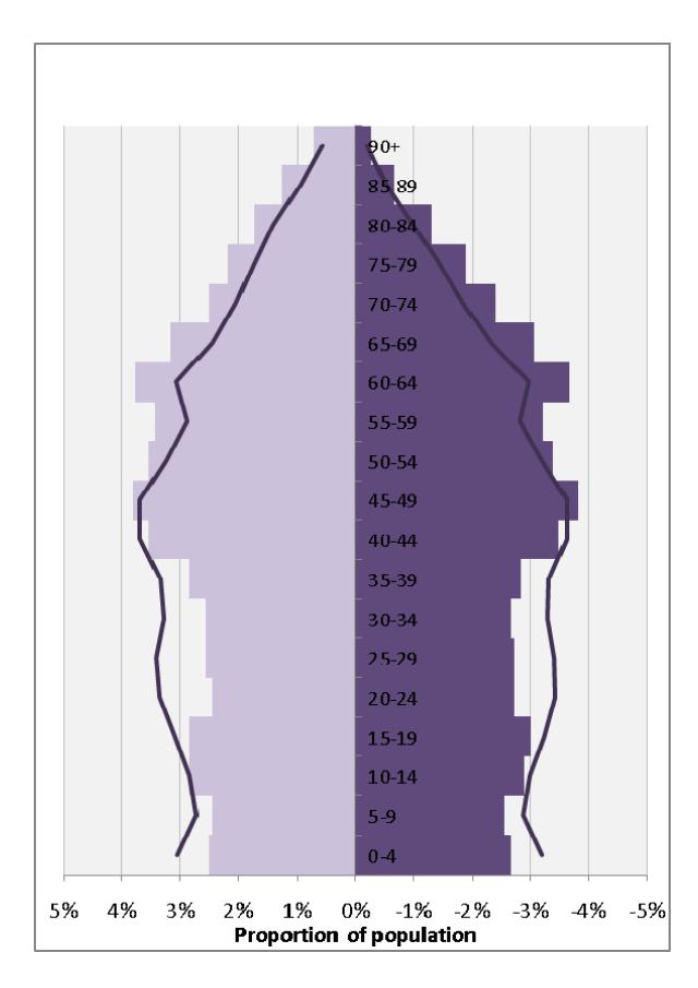
Figure 2.3 - Age structure of Herefordshire (bars) and England and Wales (lines), from the 2011 Census<sup>8</sup>