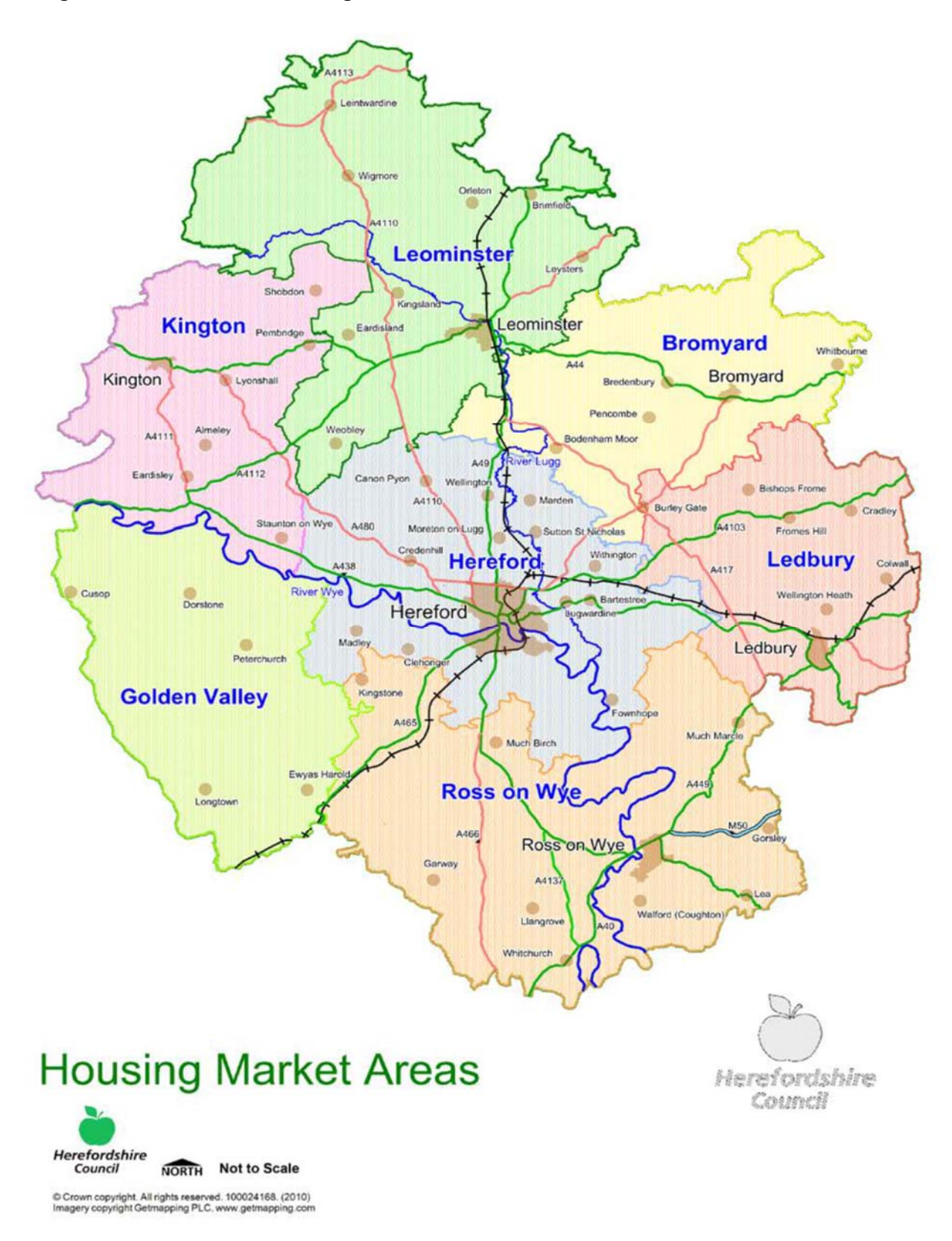
Figure 2. Herefordshire Housing Market Area