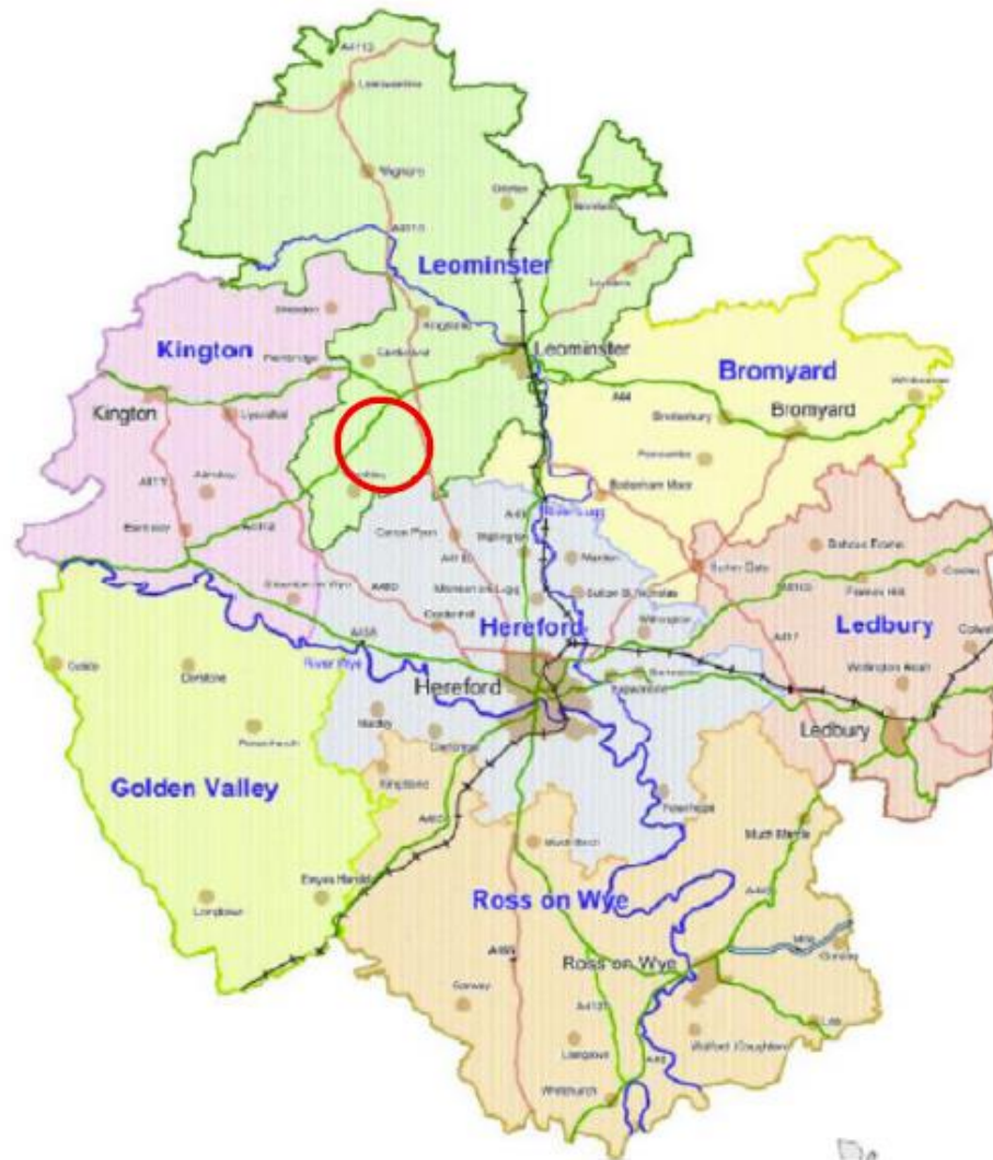
Figure 2 - Location of Dilwyn Parish within Leominster Housing Market Area.

© Crown copyright and database rights (2016) Ordnance Survey (0100059768)