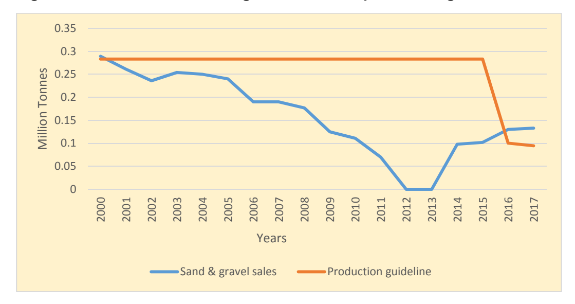
Figure 1: Herefordshire sand & gravel sales and production guideline 2000 – 2017