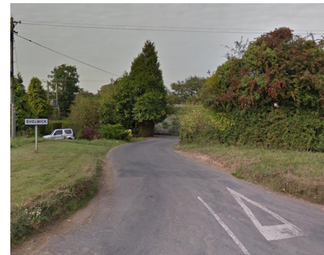
Gateway Location – Shelwick Lane