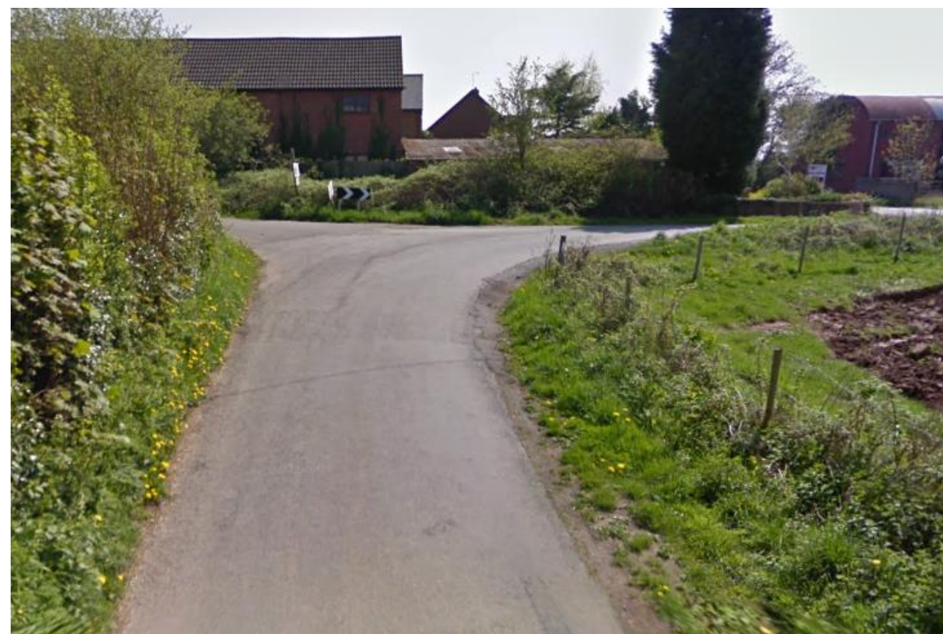
Gateway Location – Lyde Cross