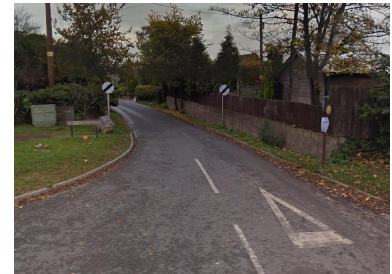
Gateway Location – Munstone Road