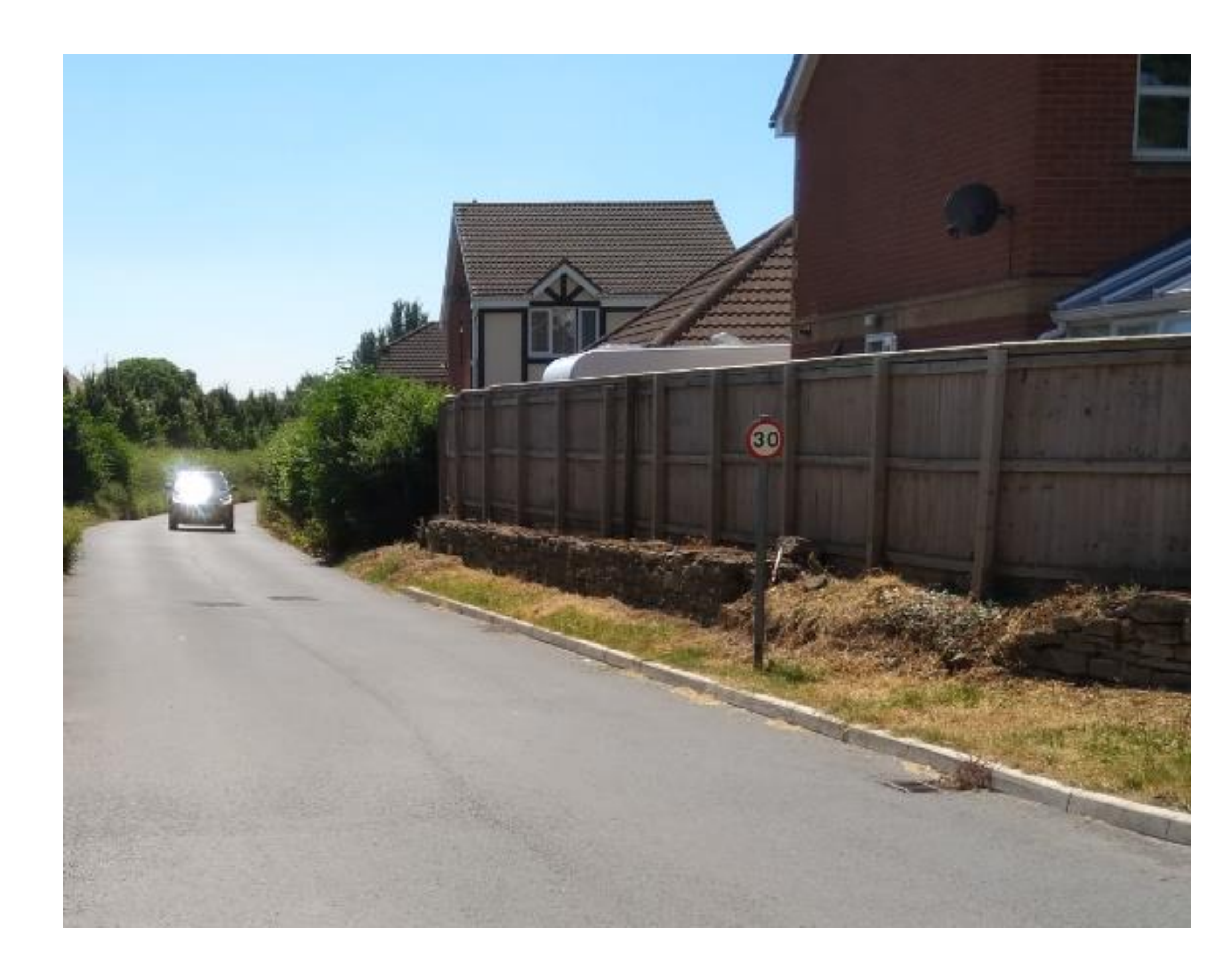
Layout of proposed speed limits