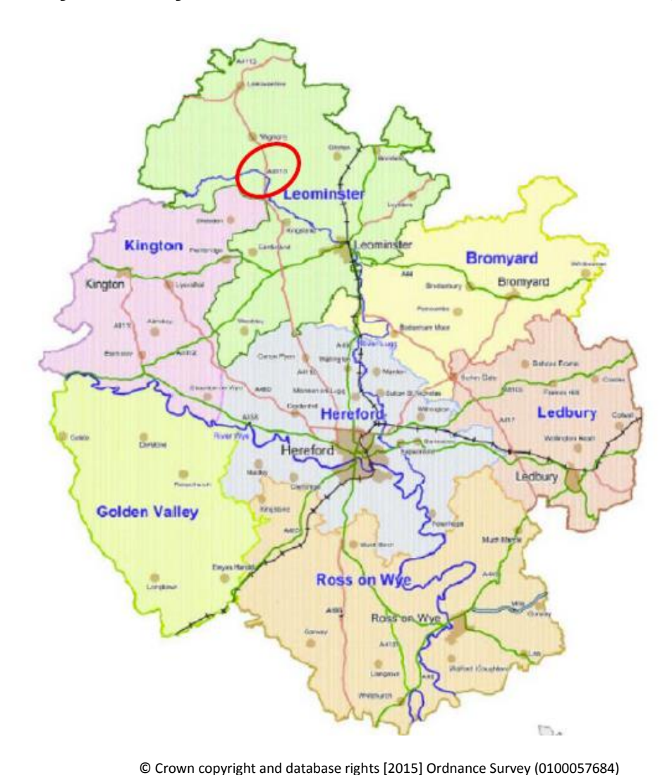
Figure 2 - Location of Aymestrey Parish within Leominster Housing Market Area.

Aymestrey Neighbourhood Development Plan – Basic Conditions Statement (March 2018)