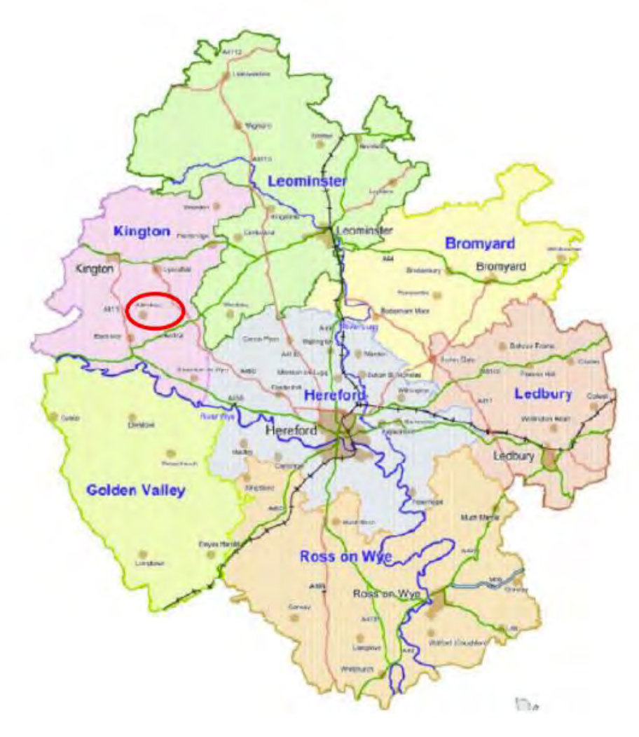
Figure 2 - Location of Almeley Parish within Kington Housing Market Area.