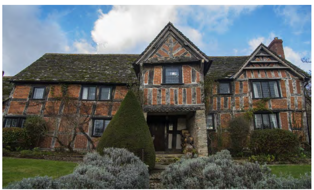
Figure 8: Almeley 15th Century Manor House

6.4 Historic England has sponsored a project to characterise the historic farmsteads within the County and it is understood it would like to see a positive approach to their conservation. Historic farmsteads are particularly important to the local settlement pattern reflecting its dispersed character. The project has identified that Herefordshire's