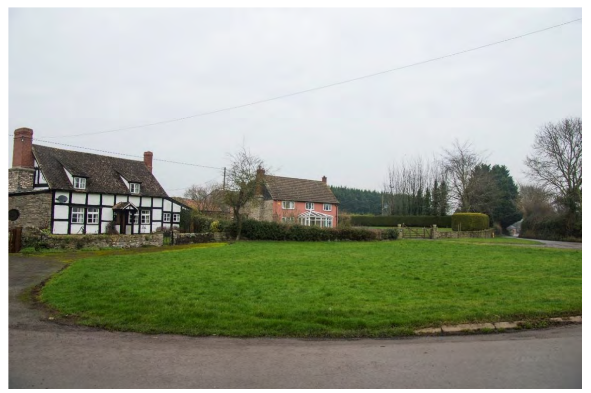
Figure 11: Pool Common, Woonton

reaching panoramic views stretching from Yazor Woods in the south-east to the Brecon Beacons in the south-west.