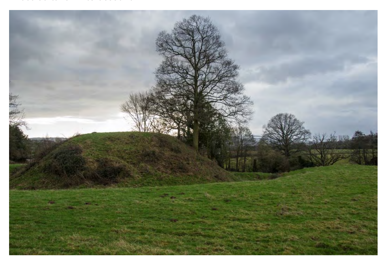
Figure 9: Remains of Almeley Motte and Bailey - Scheduled Ancient Monument

6.5 To preserve or enhance Almeley Conservation Area, the analysis set out in Appendix 1 must be taken into account.