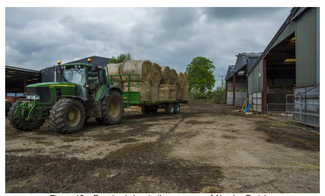
Figure 12 – Farming is key to the economy of Almeley Parish

7.1 There are no major employers or businesses within the Parish and the emphasis is upon supporting agriculture, promoting diversification of local businesses, promoting tourism and enabling home working. Herefordshire Local Plan Core Strategy policies RA5 (Re-use of Rural Buildings), RA6 (Rural Economy), E3 (Home working) and E4 (Tourism) are generally positive in covering these issues and need not be duplicated. The re-use of rural buildings and their use, where possible and appropriate as live/work units will be particularly beneficial to the Parish where the sale of Council smallholdings may result in a demand for opportunities to undertake agricultural contracting. Policy RA5 generally relates to the use of the building and does not establish criteria that might be required where uses may involve the use of notable external areas. In addition, although there is widespread support for agriculture and diversification, it is considered necessary to define what scale is appropriate to the Parish in terms of associated buildings given its environmental quality, the potential impact on the water environment, and quality of life and amenity to nearby residents.