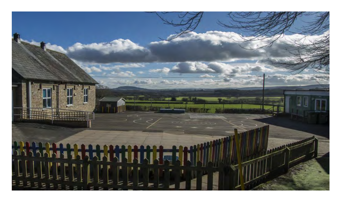
Figure 7: Unspoilt view across to the Brecon Beacons National Park from Almeley Primary School

ecological network of sites, wildlife corridors and stepping stones for the Parish current at the time<sup>10</sup>.