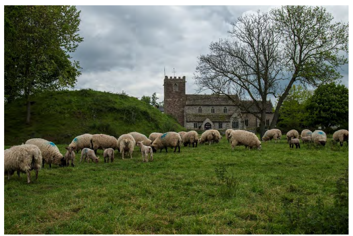
Figure 13: Farming is integral to the character of the Parish and its settlements.

7.3 There are some 23 historic farmsteads within the Parish in addition to modern complexes and some of these may have potential to accommodate businesses, either