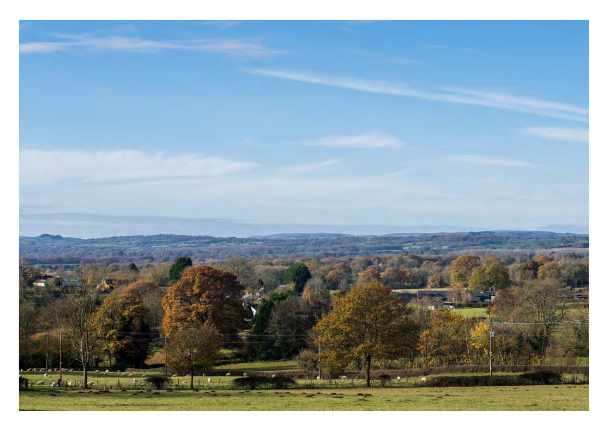
Figure 4: Rural setting of Woonton hamlet

Farm, The Batch and Almeley Wootton. Appendix 1 sets out a more detailed appraisal of the Conservation Area.