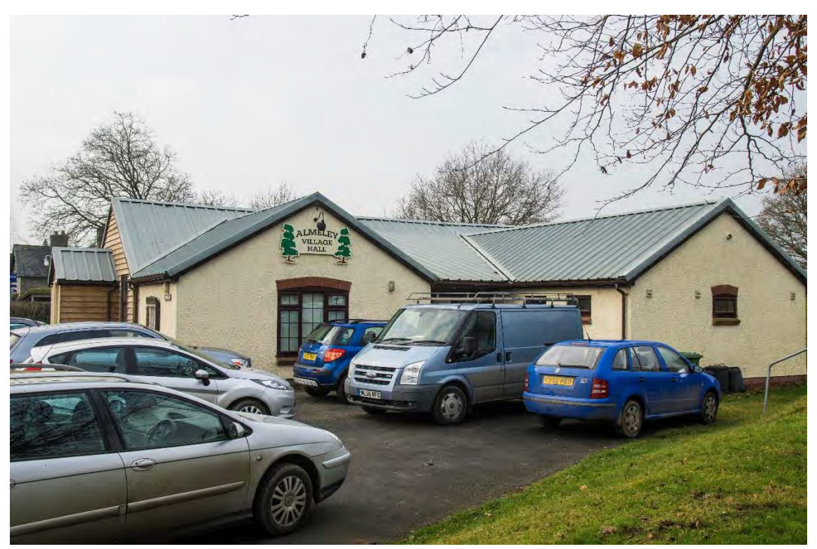
Figure 14: Almeley Village Hall

Policy ALM20: Contributions to Community Services, Youth Provision and Recreation Facilities