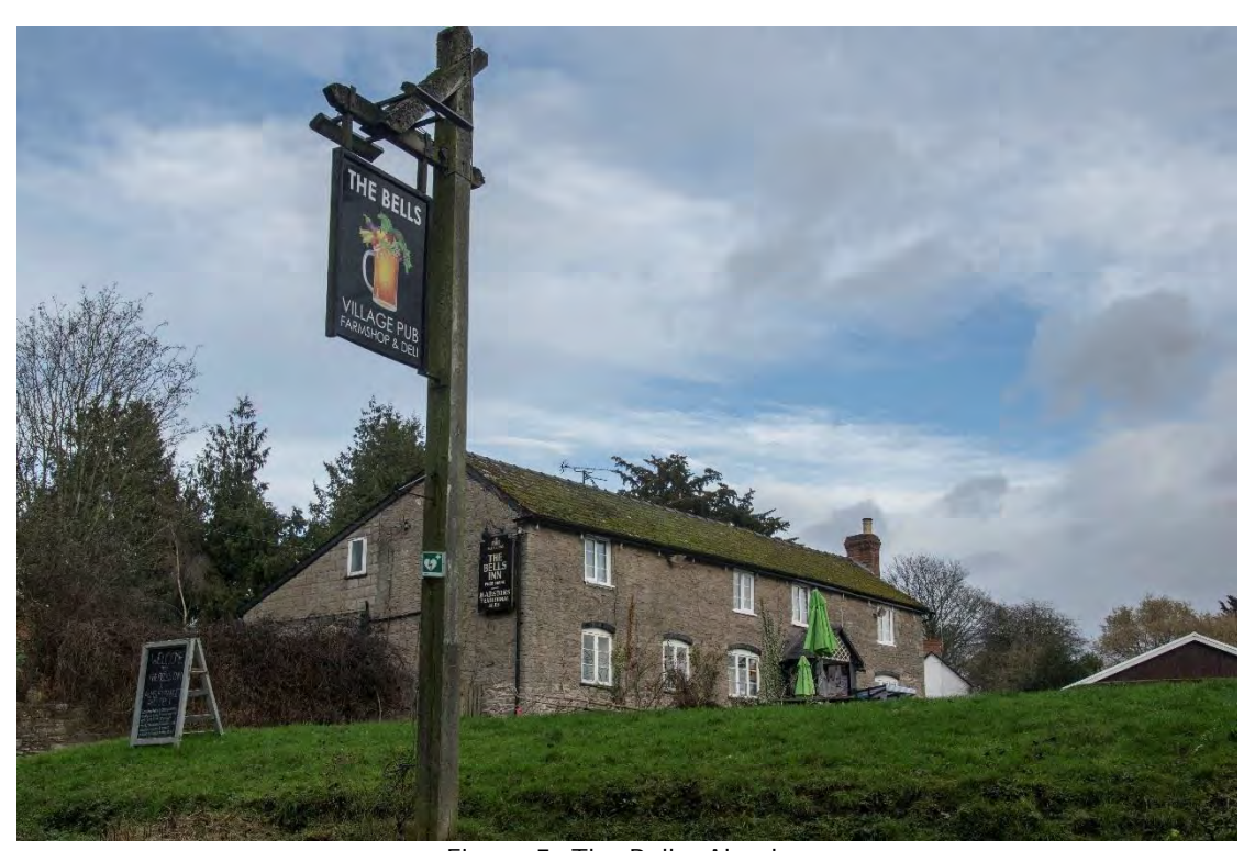
Figure 5: The Bells, Almeley