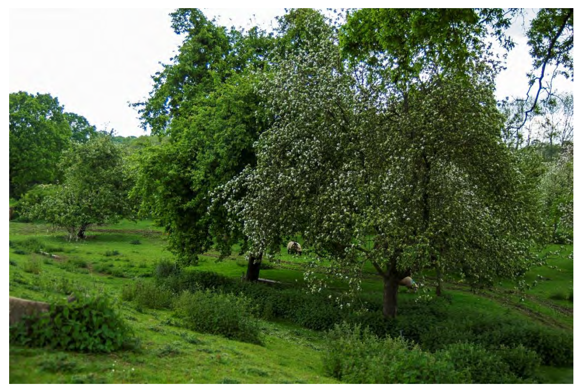
Figure 6: Traditional Orchards add significantly to local biodiversity