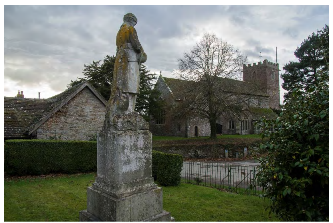
Figure 3: Almeley Church

2.24 Almeley Conservation Area was designated in 1987. It includes not only the historic portion of Almeley village but also The Batch and Almeley Wootton. Herefordshire Council prepared a draft appraisal for this area in 2006 although did not adopt this.