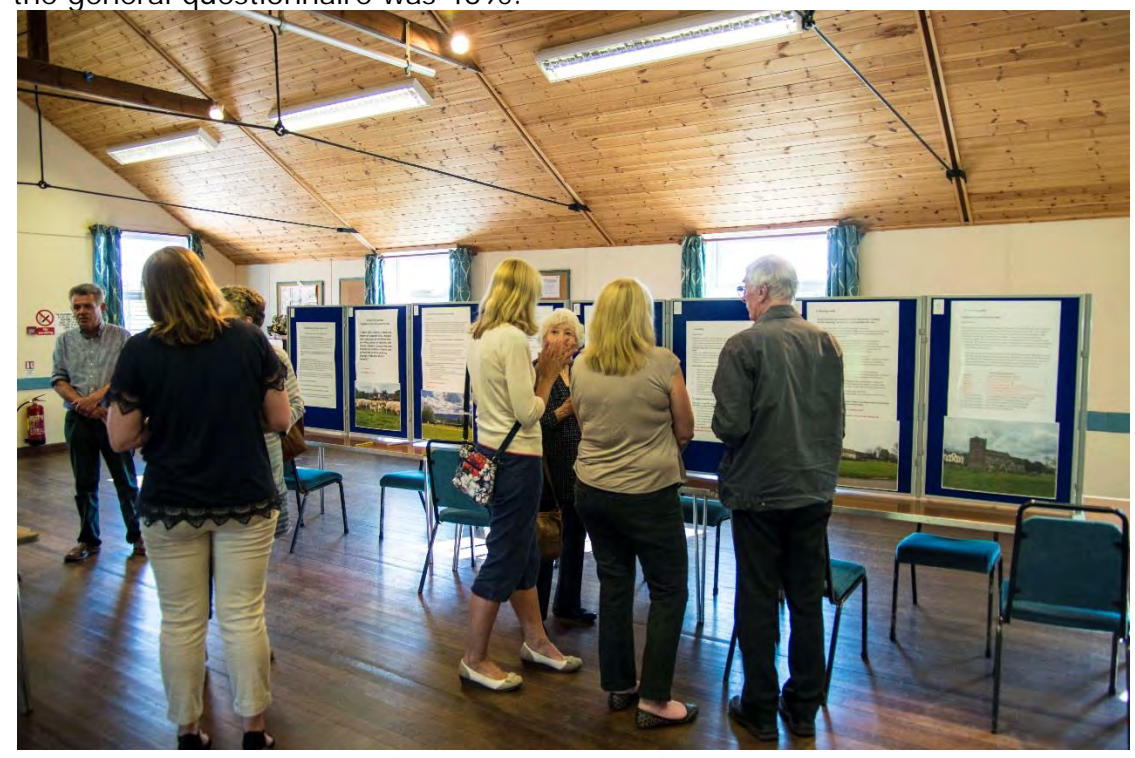
Figure 1: NDP Presentation Event

1.7 Almeley Parish Council established a Steering Group to prepare the NDP which included members from the community involved in addition to parish councillors. Local neighbourhood plan consultation events were held during 2015-2017 in order to identify issues of concern to residents and other interested parties. A general household questionnaire was circulated in the parish during 2014. The response to the general questionnaire was 46%.