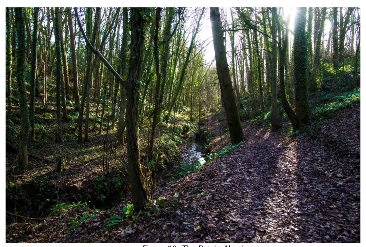
Figure 10: The Batch, Almeley

iii) <u>Pool Common, Woonton:</u> This is an area that presents itself as a small village green in front of Pool House and Pool Cottage. Pool House is a Grade II Listed Building and the common is important to its setting. Woonton Farmhouse, just to its south-west, and separated from the common by the Almeley Road is also a Listed Building and their interrelationship is important. Consequently, Pool Common is special to the community as a heritage asset and visual amenity which also allows far-