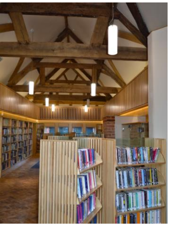
Ledbury Library in the Masters House as part of major development in 2015

This document outlines Herefordshire Council's plans for library services during the next few years; recognising the value to individuals and communities along with opportunities to support the wider objectives of the council.