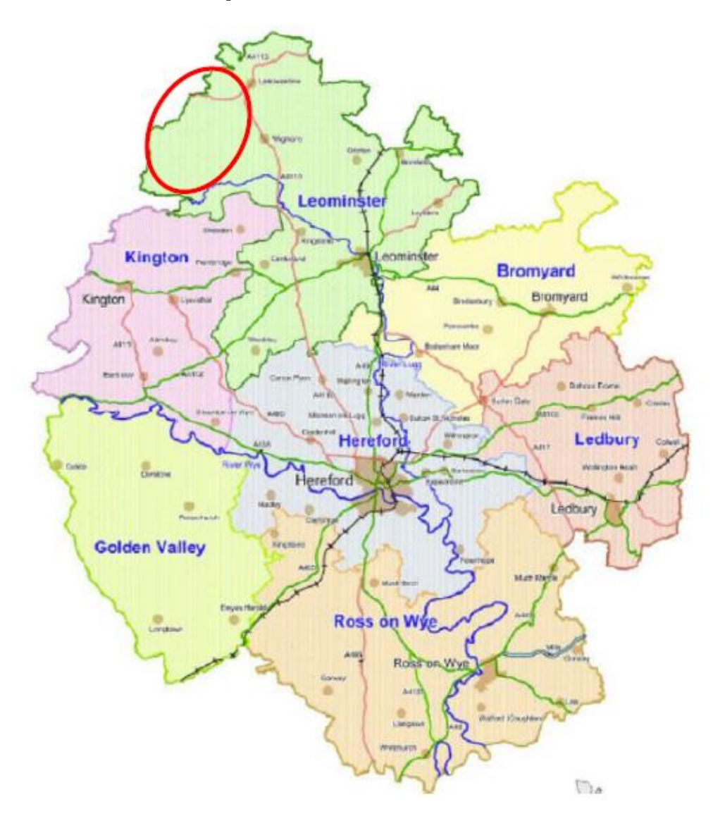
Figure 2 - Location of Border Group Parish within Leominster Housing Market Area.