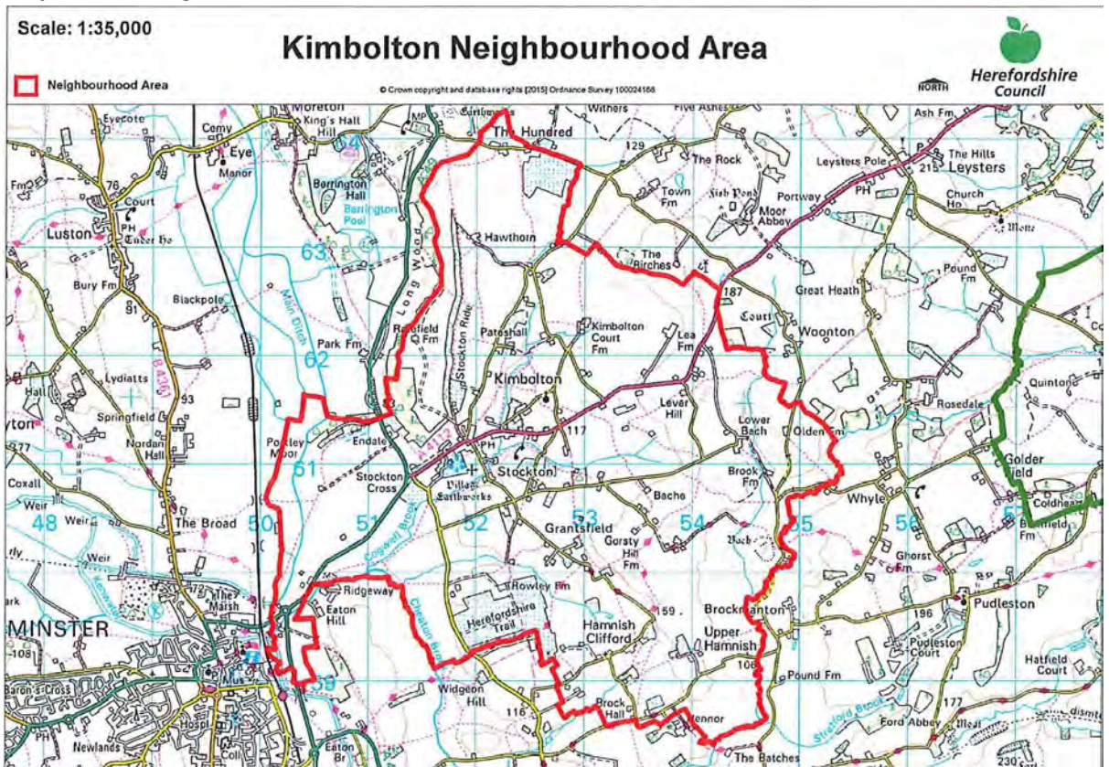
Map 1 – the Neighbourhood Plan area

1.0.1 Kimbolton is a large, rural Parish in north-east Herefordshire to the immediate east of the market town of Leominster. The Parish covers an area of 1,662ha and is irregular in shape as shown on Map 1 below.