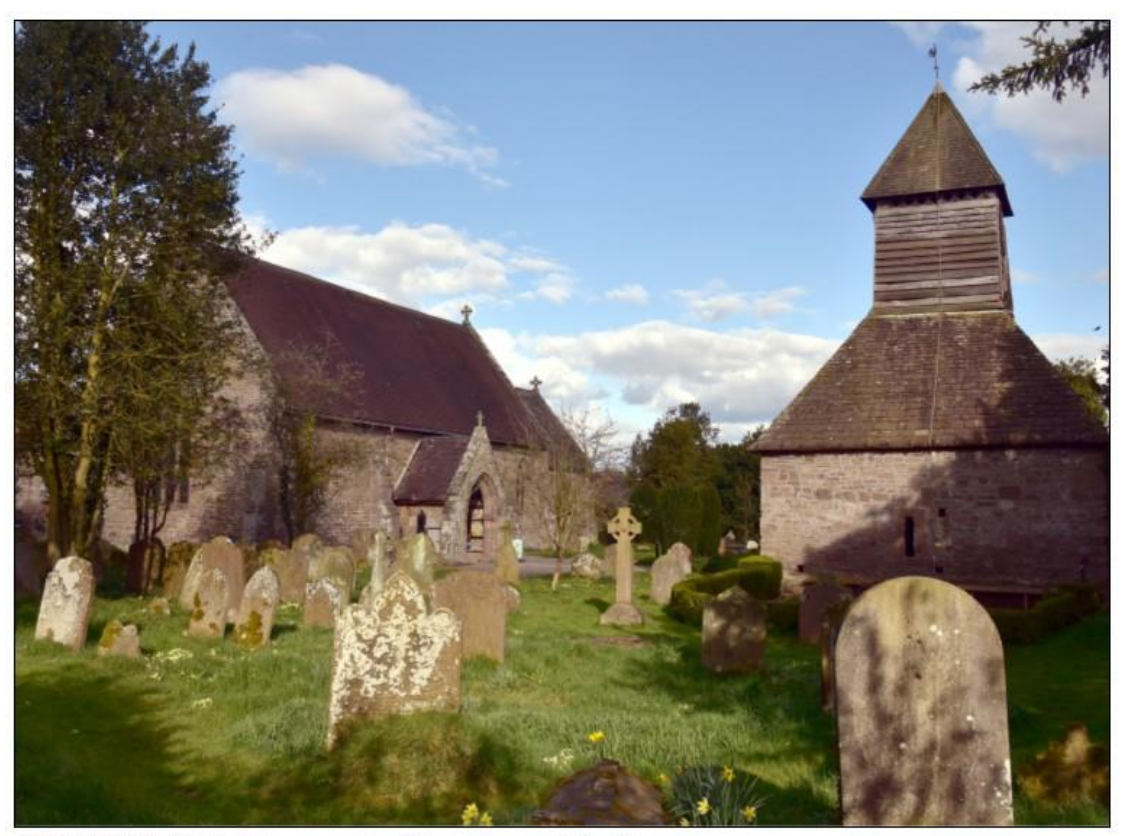
YARPOLE Saint Leonards Church and Belltower

These measures might also be used elsewhere within the village. In addition, discussions might be held with the National Trust about improving the link between Croft Castle and businesses within Yarpole in order to benefit the local economy. Improved car parking at Yarpole Parish Hall that can be utilised when the hall is not in use might also benefit such a link.