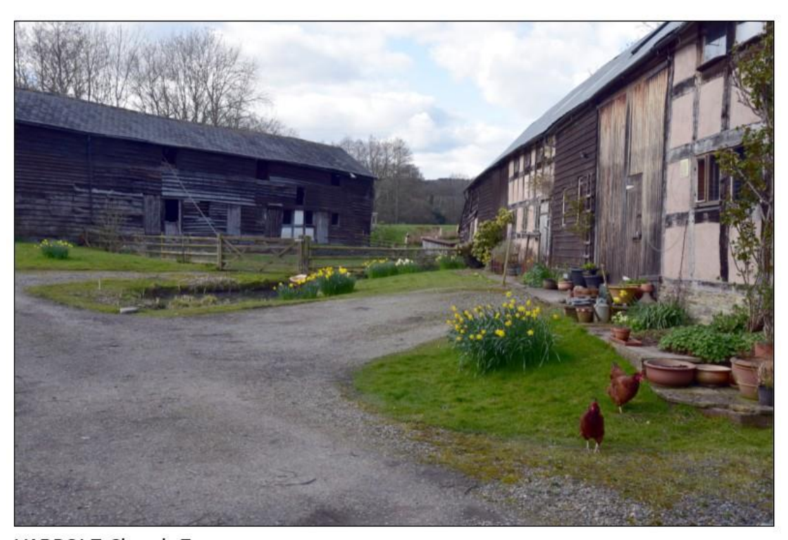
YARPOLE Church Farm

needs identified within the Local Housing Market Assessment (see Table 2). The developer should indicate how it is proposed to contribute towards the needs identified, particularly in terms of house size. Departure from proportional needs may be accepted where development provides especially for particular local community needs such as housing for the elderly or starter homes.