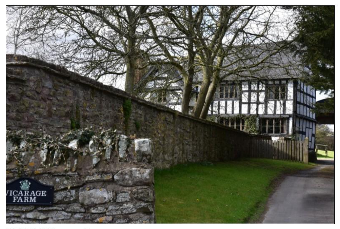
YARPOLE Vicarage Farm

6.18 The land in front of Vicarage Farm and that opposite comprising the graveyard contribute to an open green space within the village centre in the foreground of St. Leonard's Church and its separate square tower just to its south. This policy therefore seeks to protect the setting of these Listed Buildings as well as the retention of green infrastructure. It continues the protection given to these areas in the former Herefordshire Unitary Development Plan.