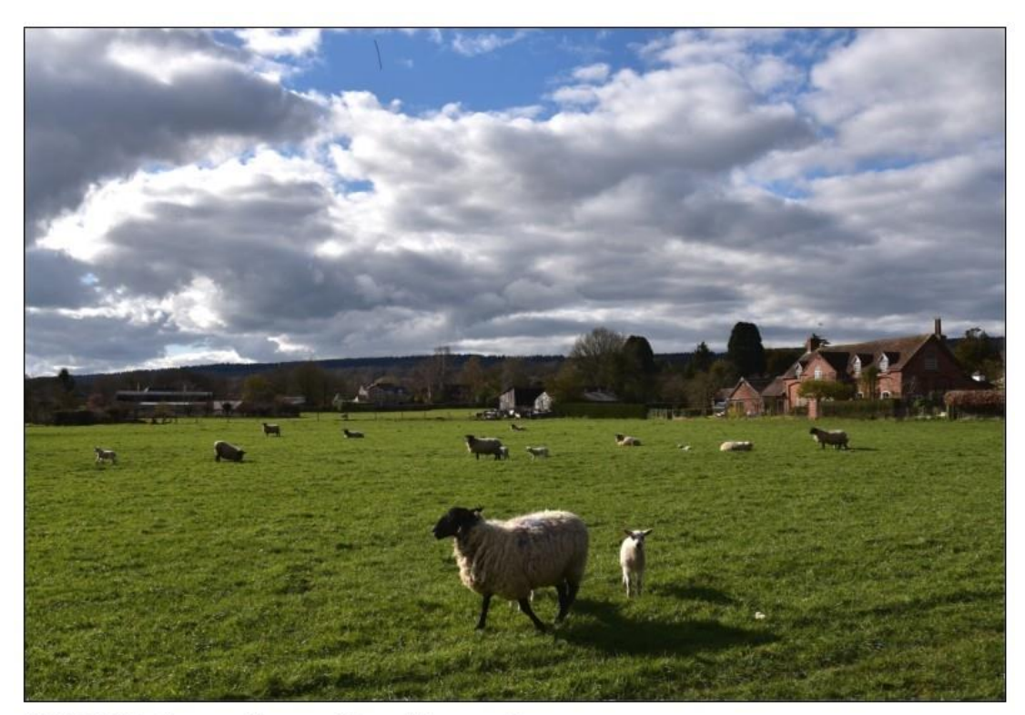
YARPOLE Lower House / Brookhouse Farms

location within the nucleated historic core. Herefordshire Council has produced a Supplementary Planning Document on archaeology and development which provides guidance on this matter.