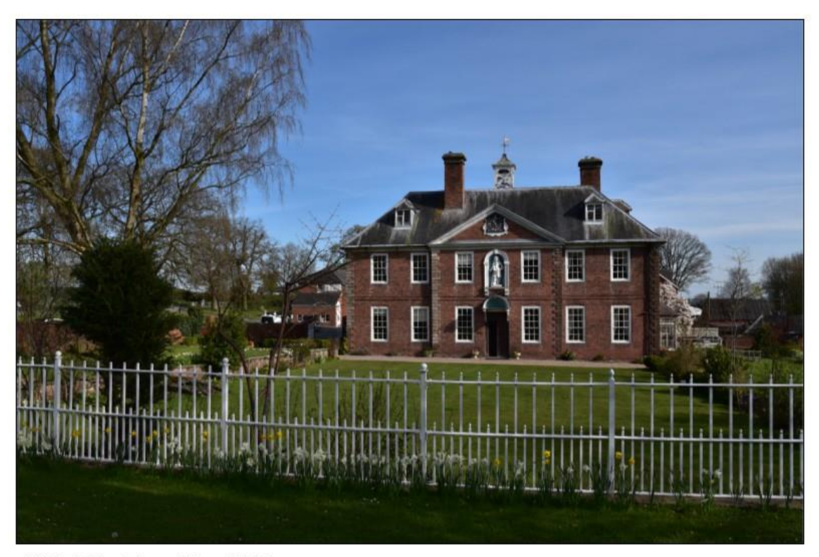
LUCTON School Est.1708

2.4 Agriculture is an important employer across the Group Parish. Lucton School is a relatively significant employer within the Group Parish and draws staff and support workers from a wide area. Most other businesses within the Group Parish are small enterprises. Again residents must travel to the nearby towns for work, although working from home presents an alternative for some.