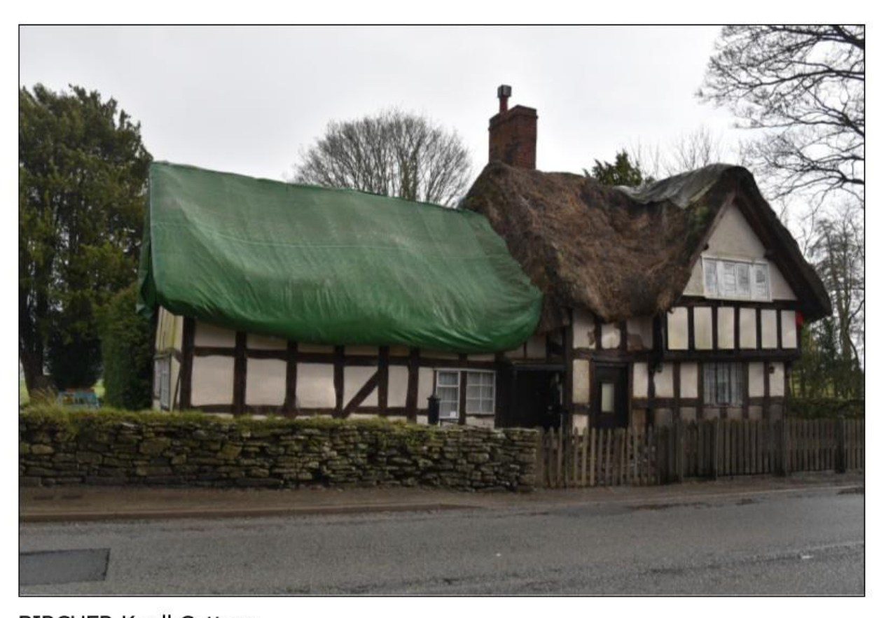
BIRCHER Knoll Cottage