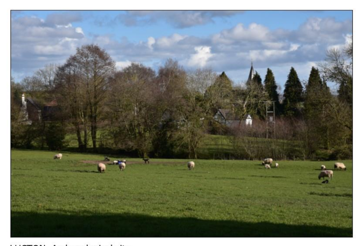
LUCTON Archaeological site

5.3 The orchard separating Orchard Bungalow from the settlement boundary is an important feature recognised in previous local plans, is still important in relation to the setting of the village and adjacent earthworks, and the gap should remain.