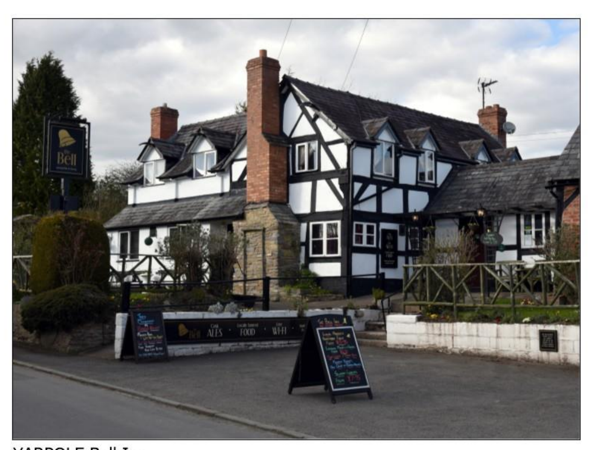
YARPOLE Bell Inn

8.5 This policy may enable resources to be obtained towards various projects which will be needed partly as a consequence of accommodating additional housing growth. Herefordshire Council will, in particular, be seeking developer contributions towards measures to increase active travel. This may include contributing towards assessing and implementing traffic calming measures set out in Policy YG11, which will contribute towards this transport objective.