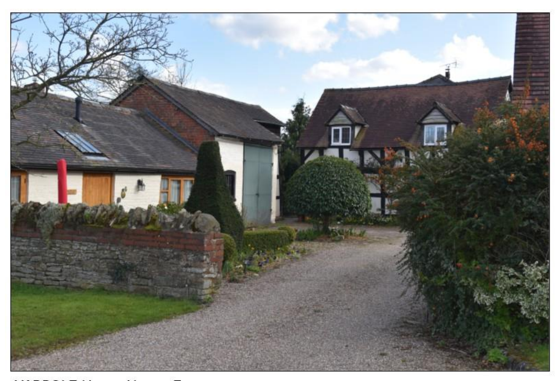
YARPOLE Upper House Farm

6.13 The combined site falls within Yarpole Conservation Area and the development will need to preserve and preferably enhance its character and appearance. Key features include the setting of the village from the east and views out of the site to the east. The retention of a view through the site in some form is required.