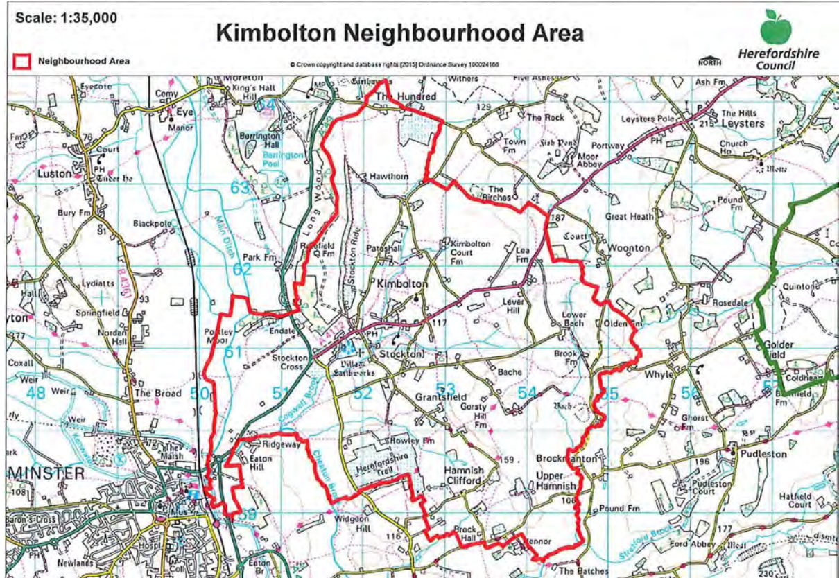
Map 1 – the Neighbourhood Plan area Scale: 1:35,000

1.0.1 Kimbolton is a large, rural Parish in north-east Herefordshire to the immediate east of the market town of Leominster. The Parish covers an area of 1,662ha and is irregular in shape as shown on Map 1 below.