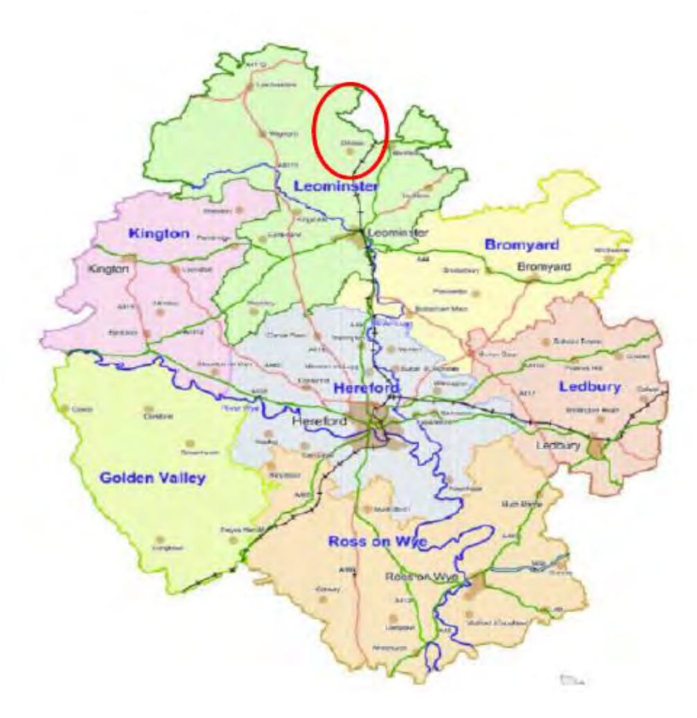
Figure 2 - Location of Orleton and Richards Castle Parishes within Leominster Housing Market Area.

© Crown copyright and database rights (2015) Ordnance Survey (100024168