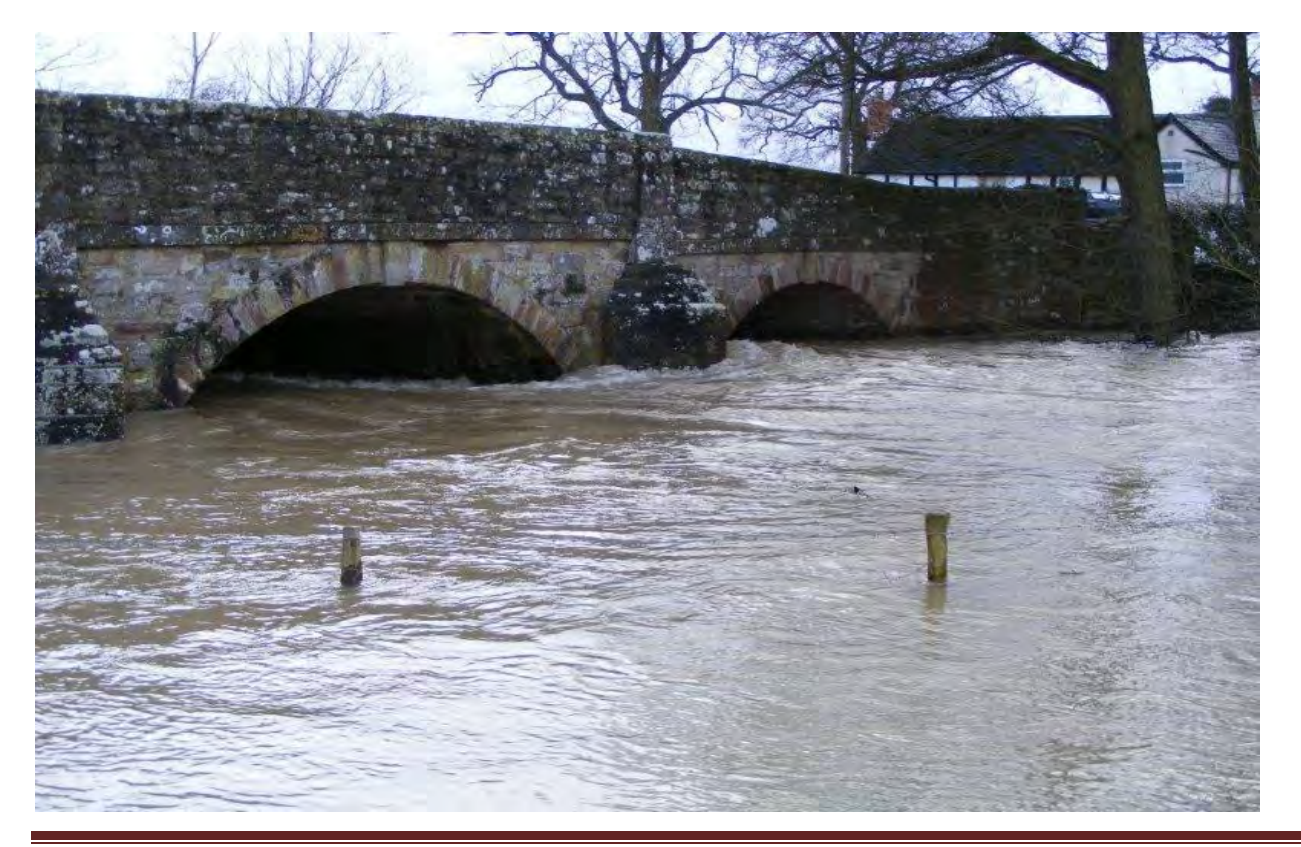
Kingsland Neighbourhood Development Plan Submission Draft - October 2015'

4.5 In addition, the community would wish to be assured that the mains sewer running through Kingsland village has sufficient capacity to accommodate further development without being overloaded and causing flooding and pollution.