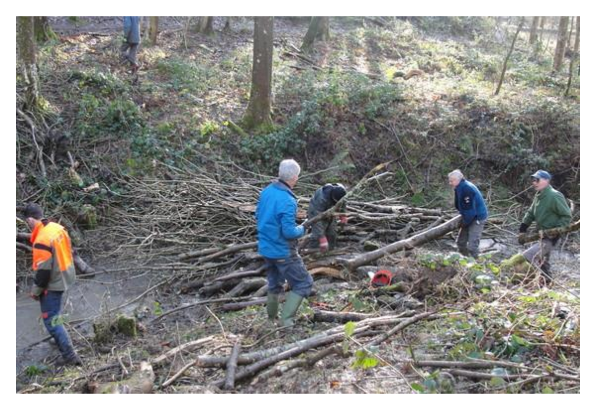
National Trust Volunteers building leaky dams at Croft Castle