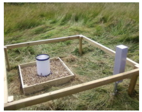
benefits of NFM.

We would like to thank all the landowners who have agreed to have monitoring equipment installed on their property. Final locations for these river and rainfall monitoring stations have been identified and landowner permissions are currently being finalised. The monitoring equipment should be installed very soon (end of April/early May 2019) and will collect 15 minute interval river level, flow and rainfall data which will be made publically available on a website. This information will help the project demonstrate the