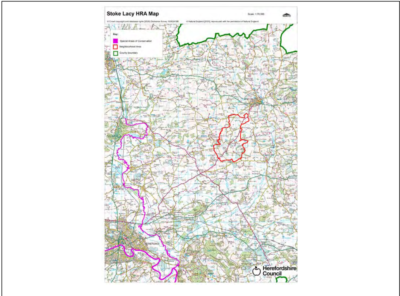
Map showing relationship of Neighbourhood Area with European Sites (not to scale)