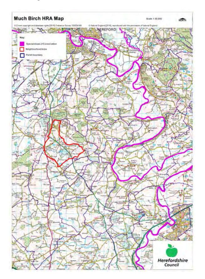
Figure 2 below highlights the location of the River Wye (including River Lugg) in relation to the neighbourhood area.