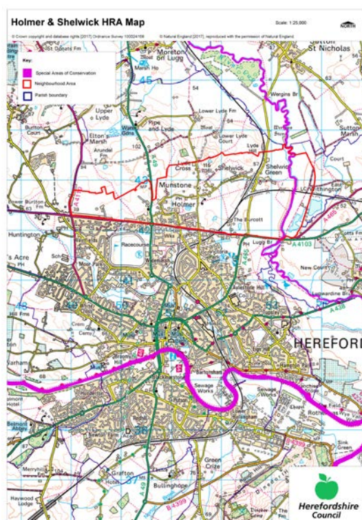
Figure 2 below highlights the location of the River Wye SAC in relation to the Holmer and Shelwick neighbourhood area.