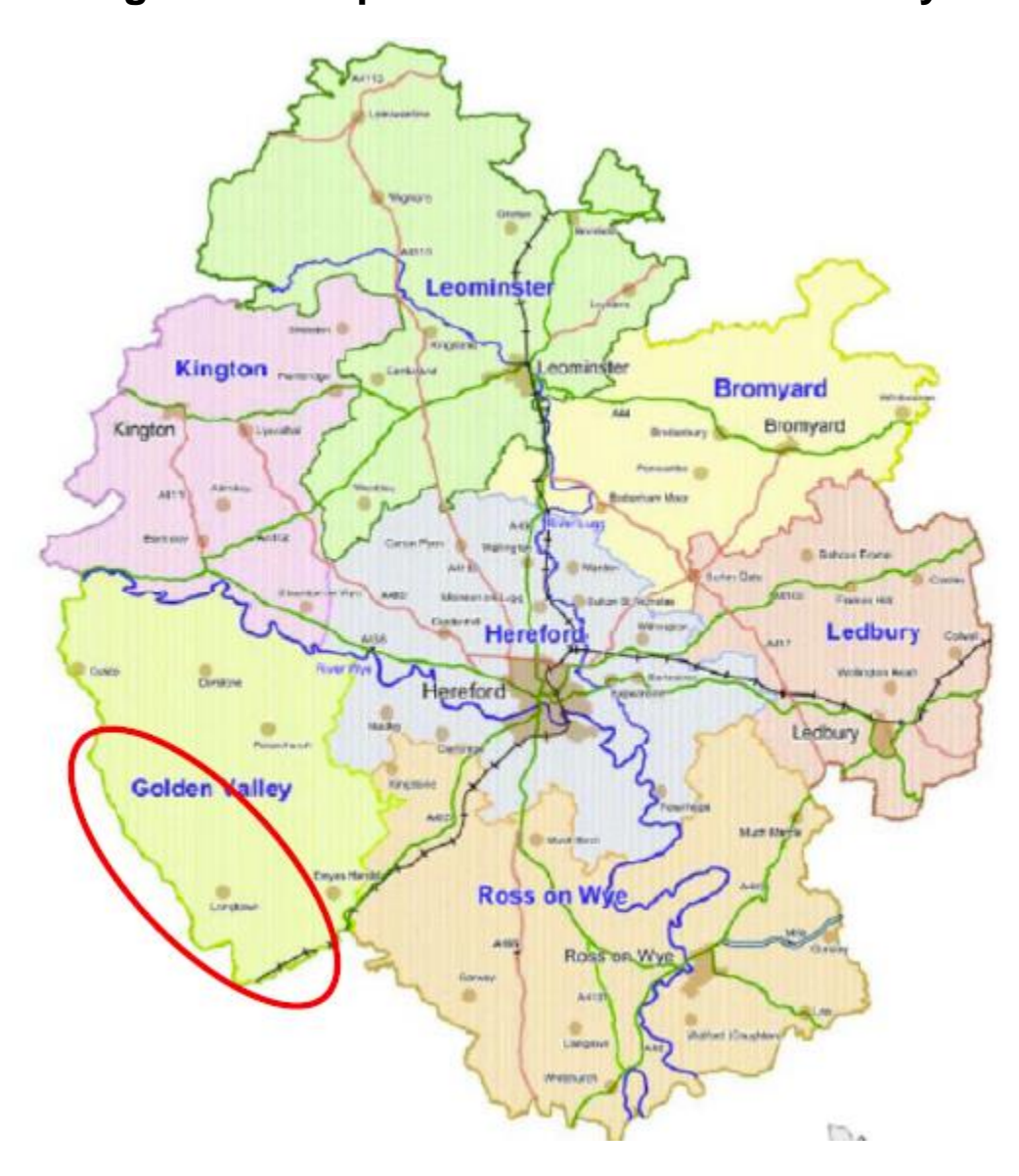
Figure 2 - Location of Longtown Group Parish within Golden Valley Housing Market Area.

Crown copyright and database rights (2017) Ordnance Survey (PSMA Member Licence 0100057486)