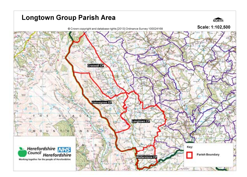
Figure1 – Longtown Group Neighbourhood Area