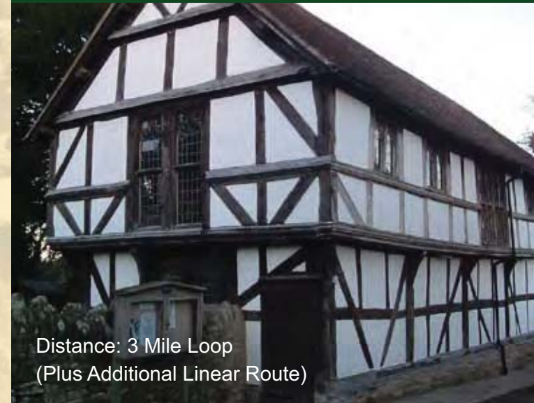
Distance: 3 Mile Loop (Plus Additional Linear Route)