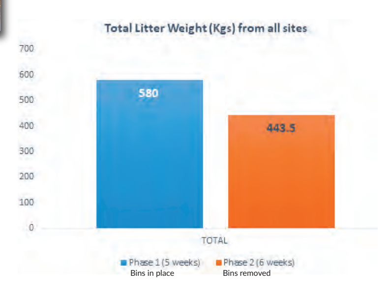
Phase 1 (bins in place) and Phase 2 (bin removal): Results indicated that the removal of the bins reduced the total level of litter across all trial locations by 23.5 % (136.5 Kgs).

The litter in the urban areas of Leominster and Penhaligon Way decreased by 40% and 81% respectively.