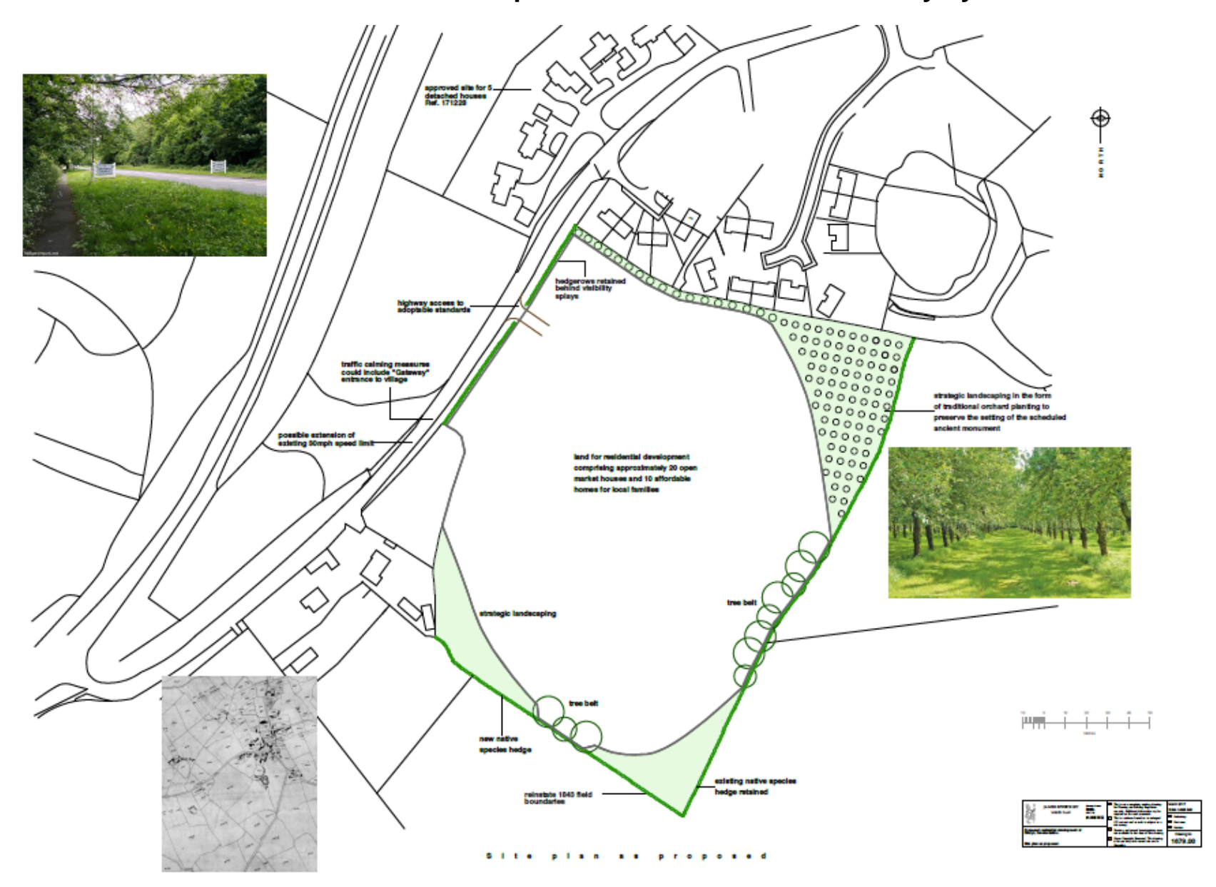
Annex 1: Outline of Broad Principles Presented to the Community by Landowner