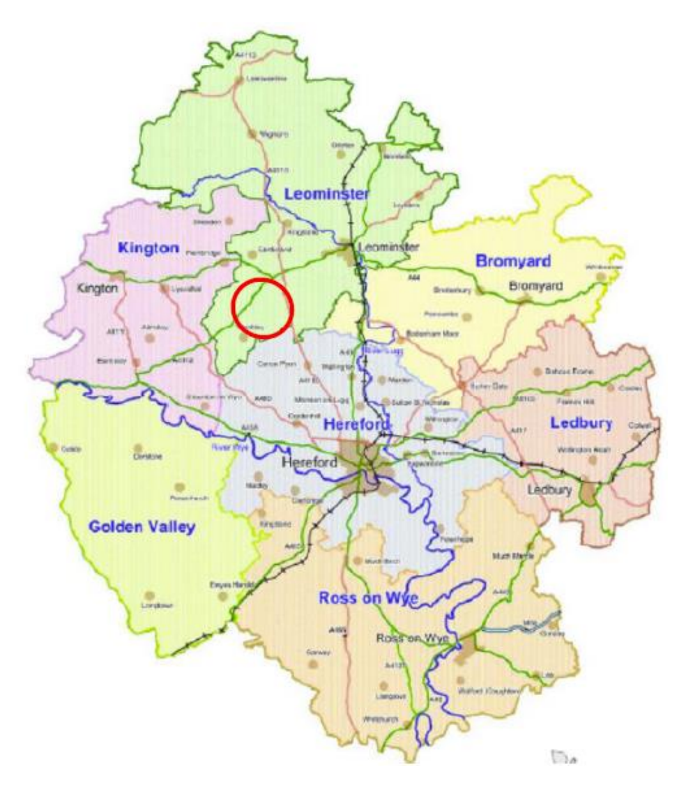
Figure 2 - Location of Dilwyn Parish within Leominster Housing Market Area.