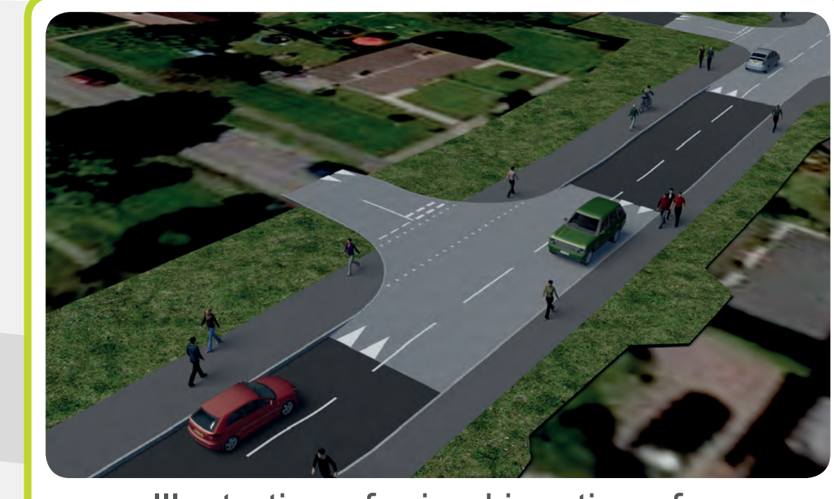
Illustration of raised junctions for Faraday Road and Golden Lion Close