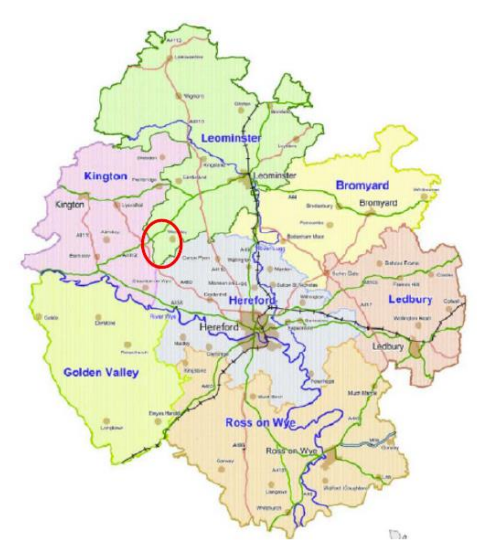
Figure 2 - Location of Weobley Parish within Leominster Housing Market Area.