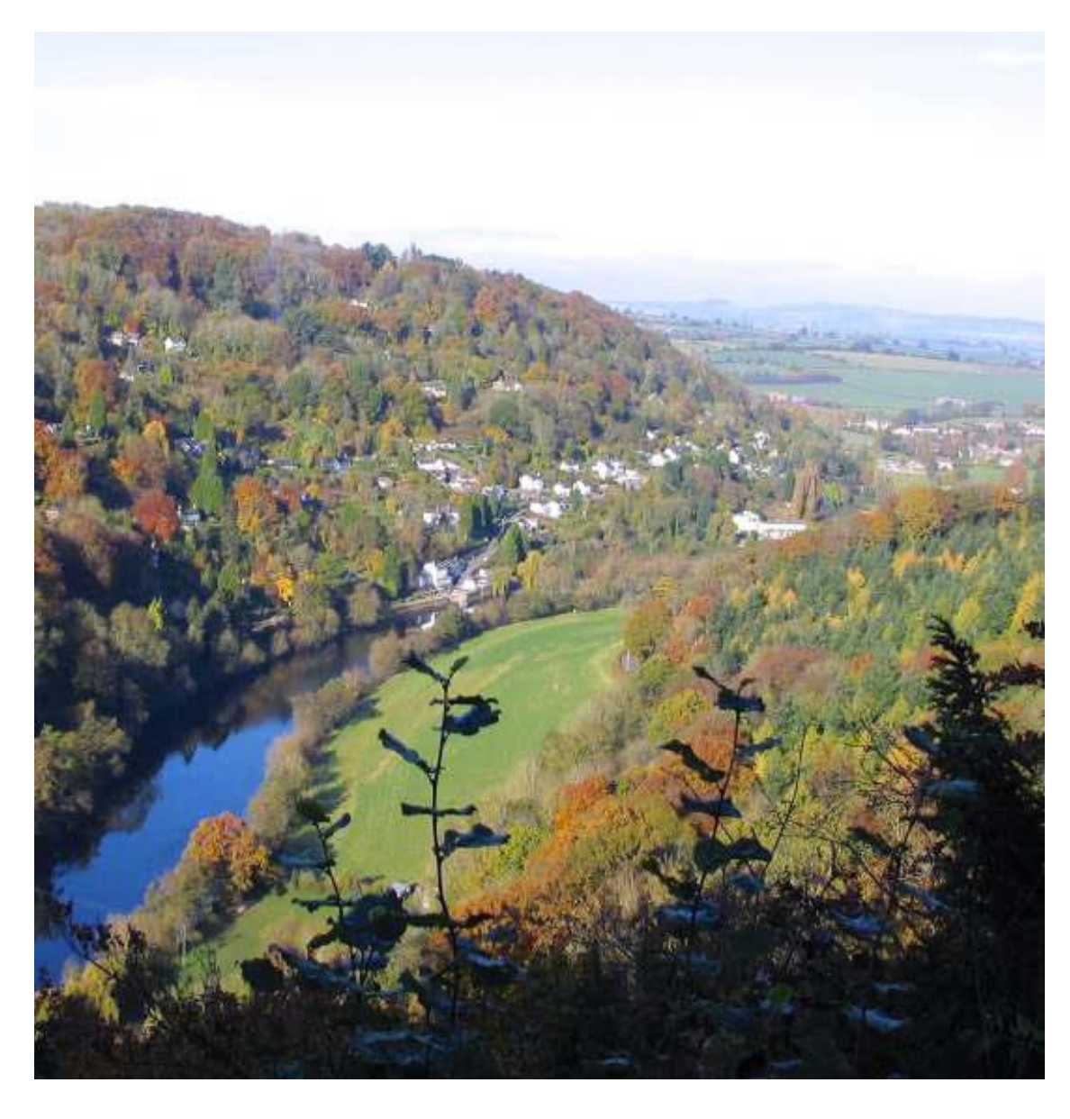
Submission Draft October 2018