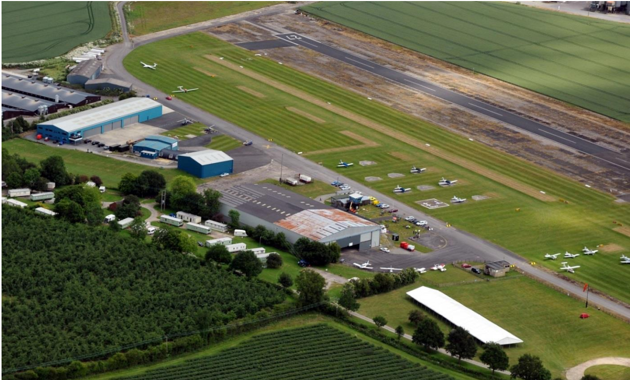
Figure 5 - Shobdon Airfield

various leisure and recreational activities, industry, commercial operations and intensive poultry units. The airfield is used principally, although not exclusively, for pleasure flying. There is no doubt that the area has, through historical reasons, become important as an employment centre with its many buildings being used for a variety of purposes.