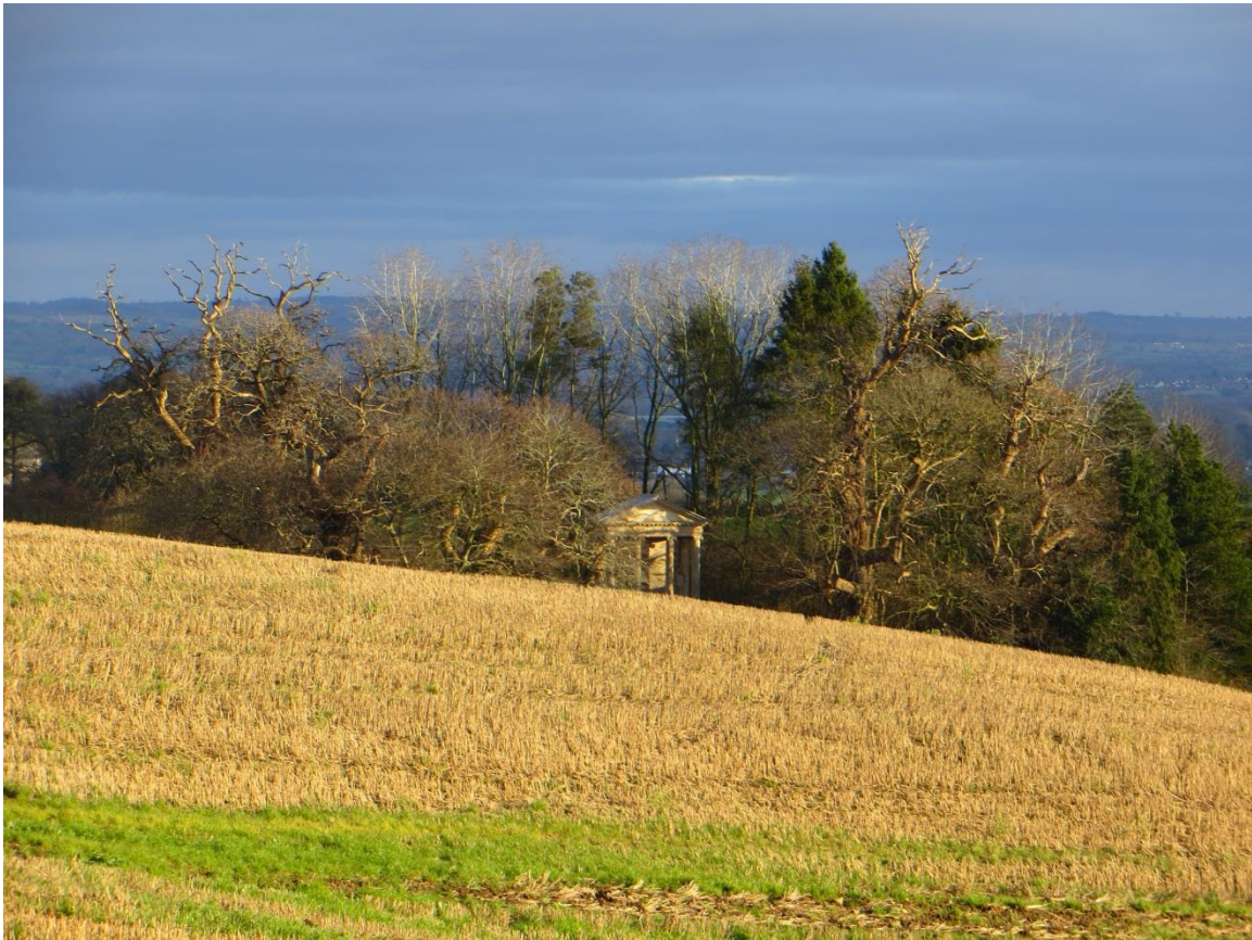
Figure 1 – The Folly, Shobdon Park