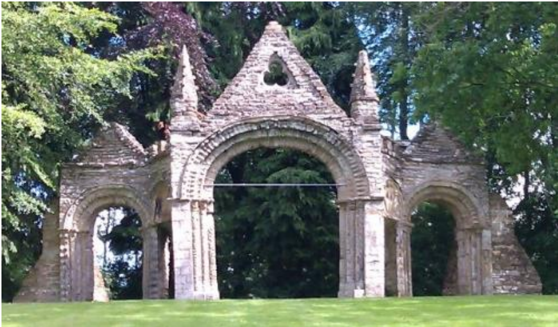
Figure 2: Shobdon Arches

upon the general direction that policies covering a number of issues might take. These have been used to inform this plan and further details of the consultations undertaken will be included in a Consultation Statement to be prepared for submission to the Inspector appointed to consider the plan after further formal community consultations have been undertaken.