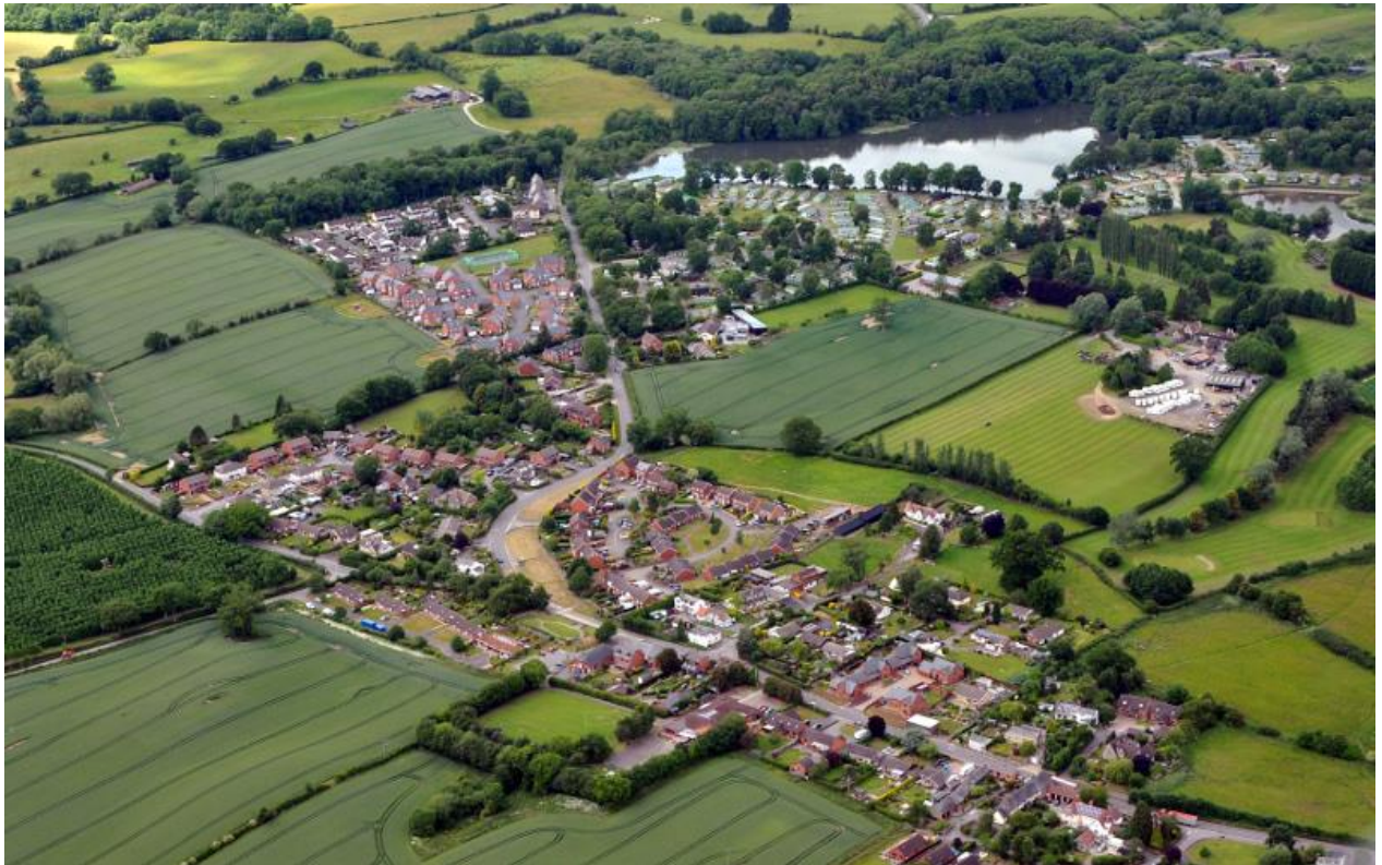
Figure 4 – Shobdon Village