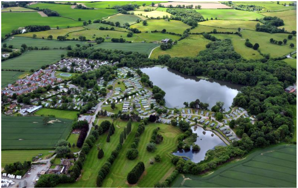
Figure 6 - Pearl Lake Caravan Park