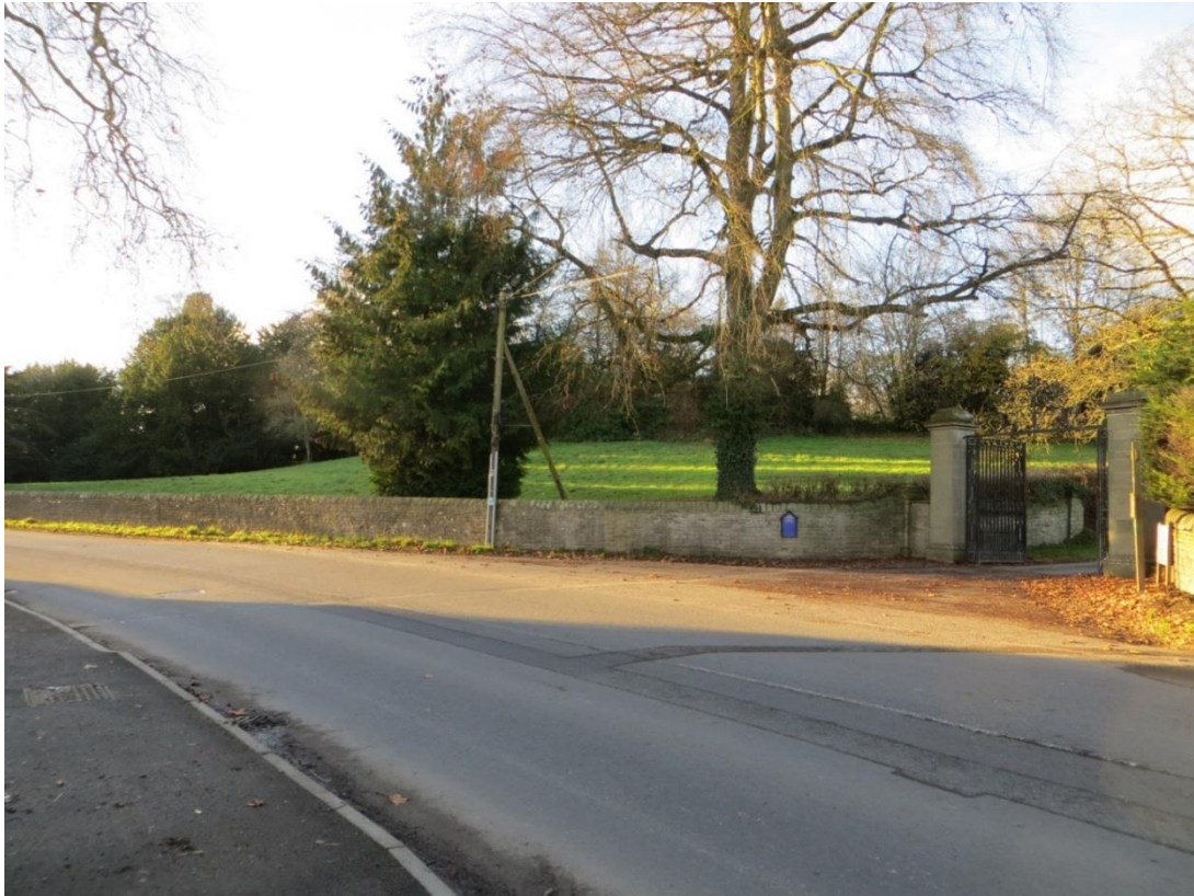
Figure 8 – Local Green Space on North side of Main Road either side of the stream passing under Shobdon Bridge