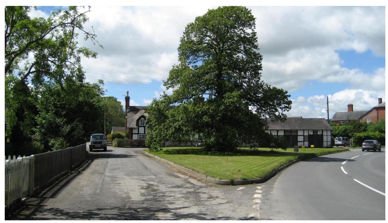
Figure 1 - Brampton Bryan has a particularly distinctive historic character