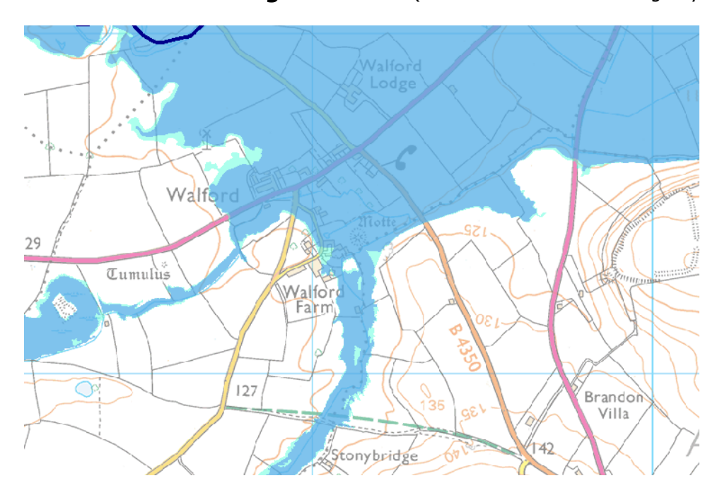
Map 1: Areas at Risk of Flooding at Walford (Extract from Environment Agency's Flood Map)