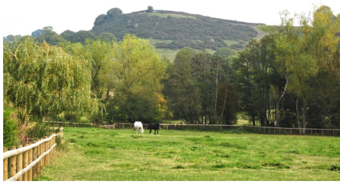
Figure 12 – View from Lingen across to Copse Hill

iv) Watercourses - The interpenetration of the village by Lingen Brook (north east to south east) and Limebrook (west to south east) provides lines of sight into background views, as well as breaking up and connecting more developed areas of the village.