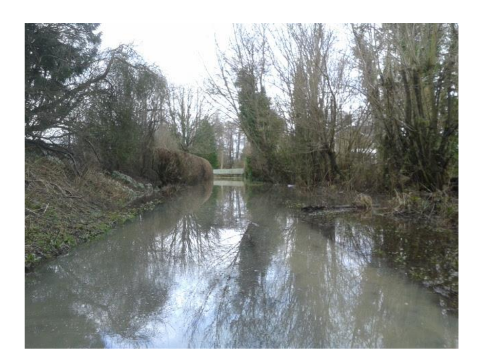
Figure 9 – Flooding is a major constraint at Walford (Looped Lane off Lingen Road - February 2014)