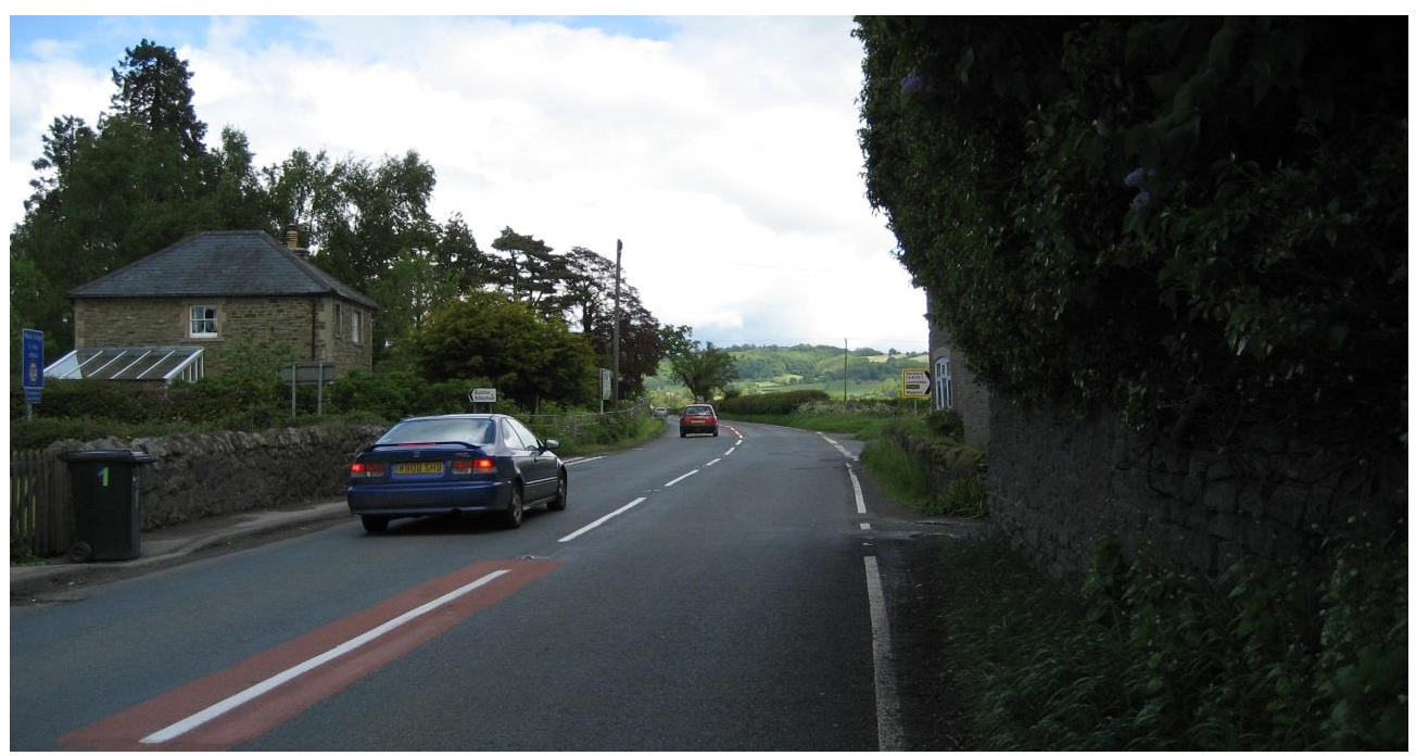
Figure 7 – A44113 through Walford