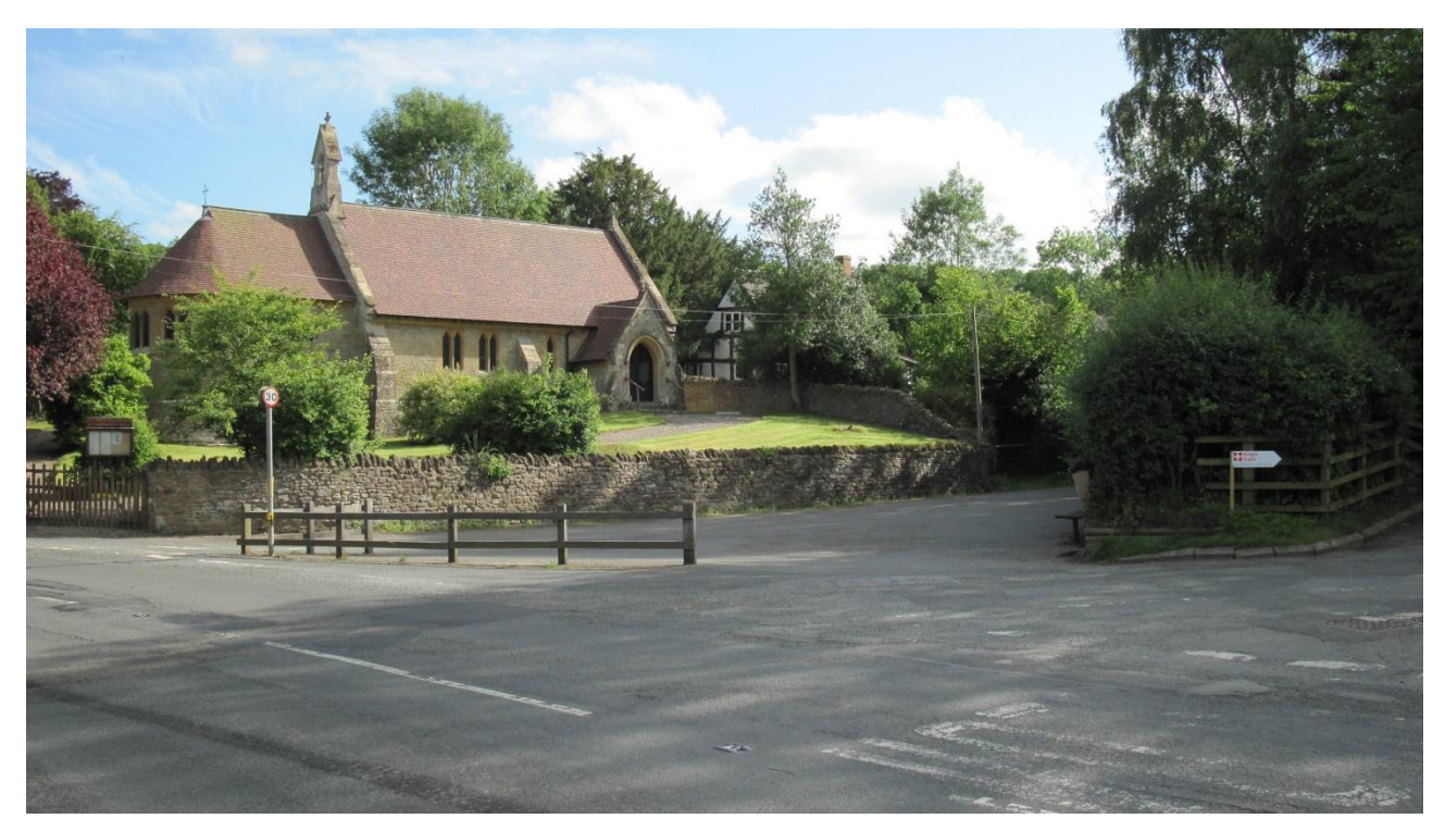
Figure 10 – Adforton Parish Church which doubles as a Community Hall.