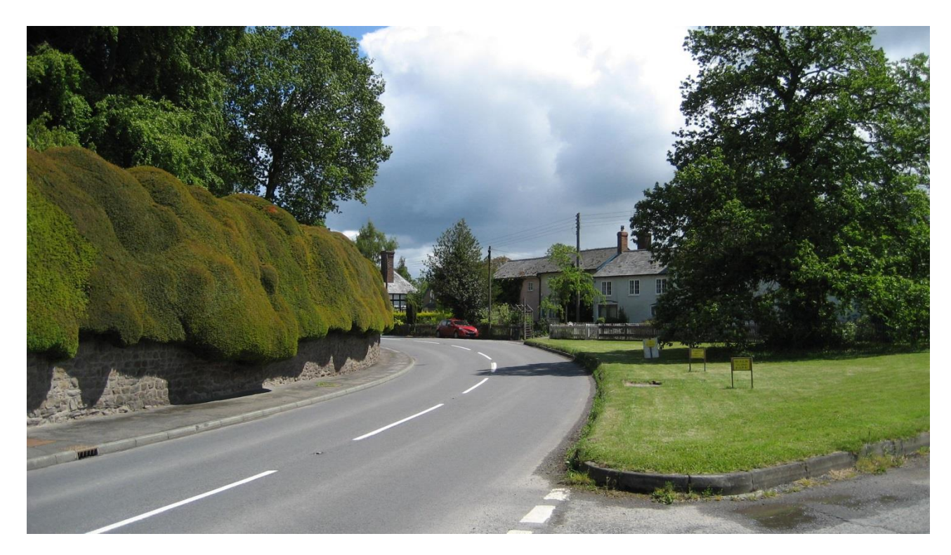
Figure 11 - The Yew Hedge through Brampton Bryan is one of the Village's many Historic and Locally Distinctive Features

6.3 The high quality and varied landscape is accompanied by significant areas and corridors of ecological value and these are highlighted upon Herefordshire Council's Ecological Network Map<sup>7</sup>. The River Teme is a Site of Special Scientific Interest, as is the River Lugg that lies just outside of the plan-area although it is fed by the Limebrook that flows from the north-west through Lingen. A number of sites of local interest cover significant parts of the plan area and proposals associated with these should identify how they might add to the level of biodiversity within the wider network as well as improving their own value. The same approach should be taken in relation to features that form important habitats such as ponds, hedgerows and orchards. Where these may be lost compensatory measures should be provided. Policy BG20 should be read in association with Herefordshire Local Plan Core Strategy LD2 which sets out the levels of protection that should be afforded to particular biodiversity and geodiversity assets