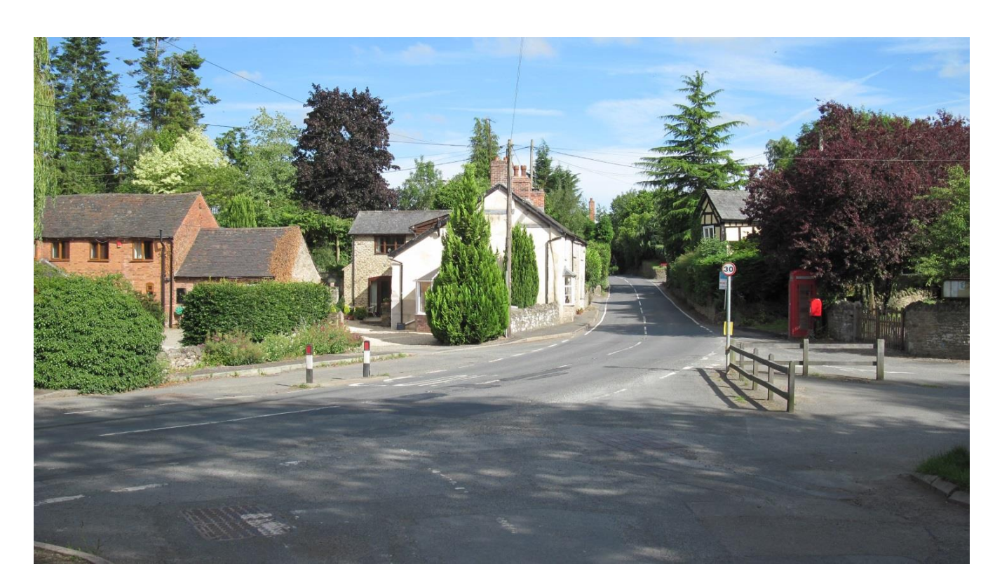
Figure 3 – A4110 Main Road through Adforton