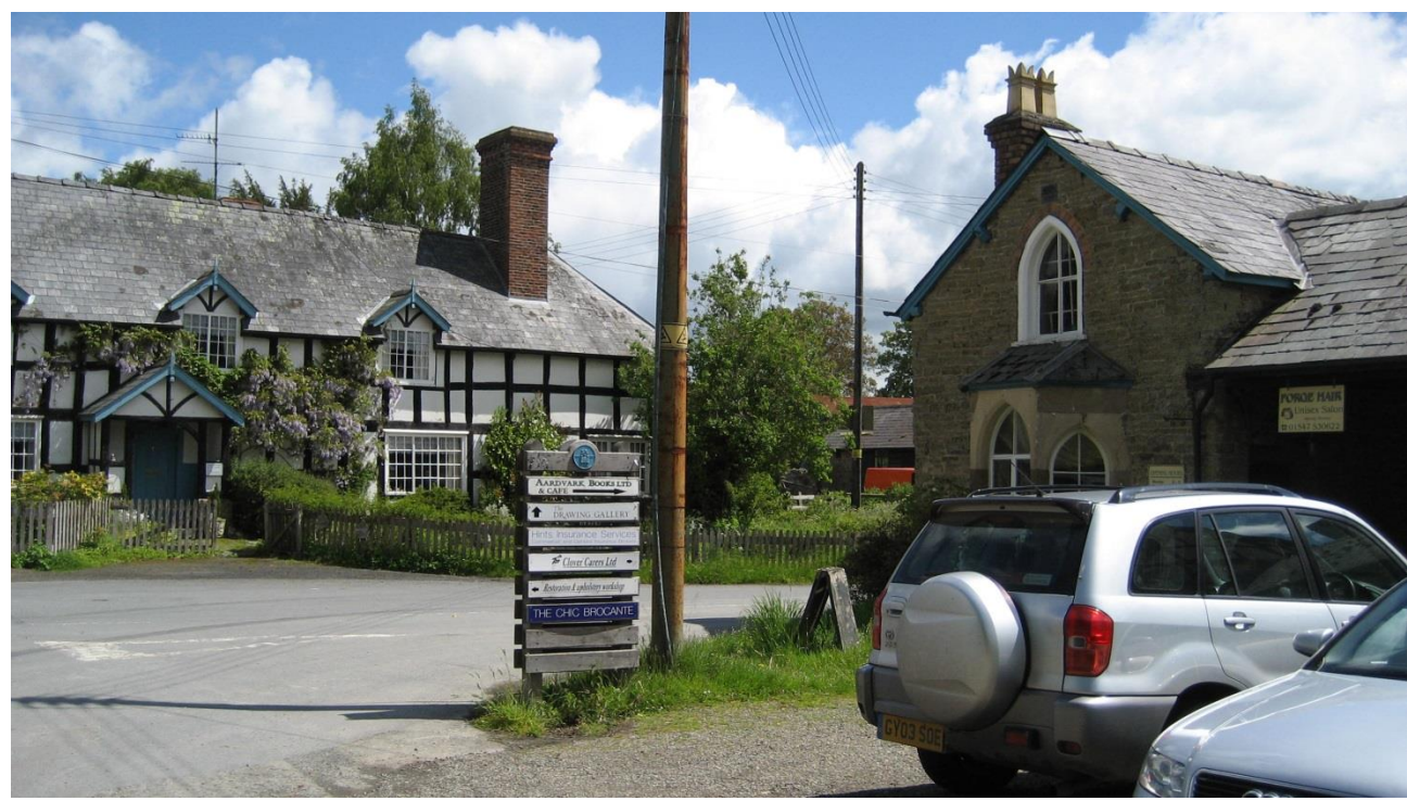
Figure 8 – Accommodating Rural Enterprises in Brampton Bryan