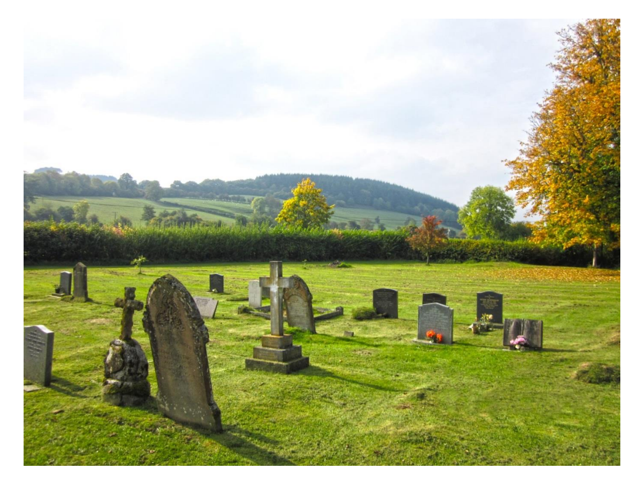
Figure 6 - View across Churchyard to Lingen Vallet Wood

the 1940's, a rendered stone stack to rear and wood windows and doors. The roadside barn is probably C17, with later lean-to additions to north and east, and has an oak frame with deep, tarred weatherboarding, and a Welsh slate roof. The barn immediately south of the farmhouse is possibly slightly later in date but is also oak-framed with weatherboarding and a Welsh slate roof, and has more modern farm-buildings attached which may be technically Listed but have no historic interest. These buildings should be retained. Other buildings on the site include a 1950's milking shed with partly slate roof and evidence of an earlier timber-frame and with a steel-framed extension to the south; a probably 1990's portal-framed unit; and a c.2000 roofed sileage clamp. The loss of the more recent buildings and their replacement through sensitively design and orientated buildings may enhance the setting of those that should be retained.