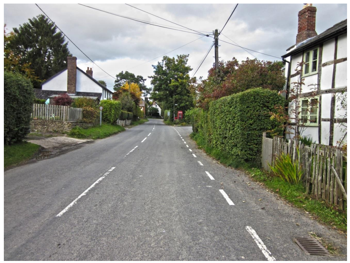
Figure 5 - Lingen looking north through village from the Bridge

Local Plan which has been reviewed, taking into account the village's character and how it might accommodate development.