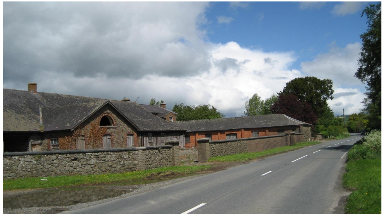
Figure 2 - Redundant Barns at Walford