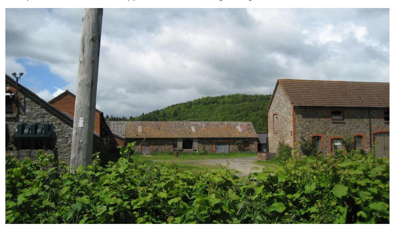
Figure 4 – Barn Complex at Brampton Bryan contributes to the Village's Character and Distinctiveness and its potential conversion to dwellings is proposed.

accommodating limited new development. Such development should be in the form of low density housing that is sited to avoid coalescence. Development should be of a modest size to preserve the character of the existing settlement. Although presenting the appearance of being a reasonably sizable village, it is fairly typical of this description, being based upon a number of farmsteads. It has, however, achieved a greater level of development in the past through its historical association with Brampton Bryan Hall and Castle. Recently though there has been no modern building with development comprising change of use of existing buildings to residential or, most often, business use. The village presents a strong historic and architectural form with a number of Listed Buildings, a range of others locally important individual and groups of buildings and a number of character areas. Their overall and group effect upon the character and appearance of the village is significant.