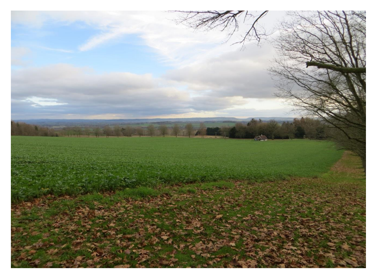
Figure 3 – Long distance view southwards from Shobdon Arches