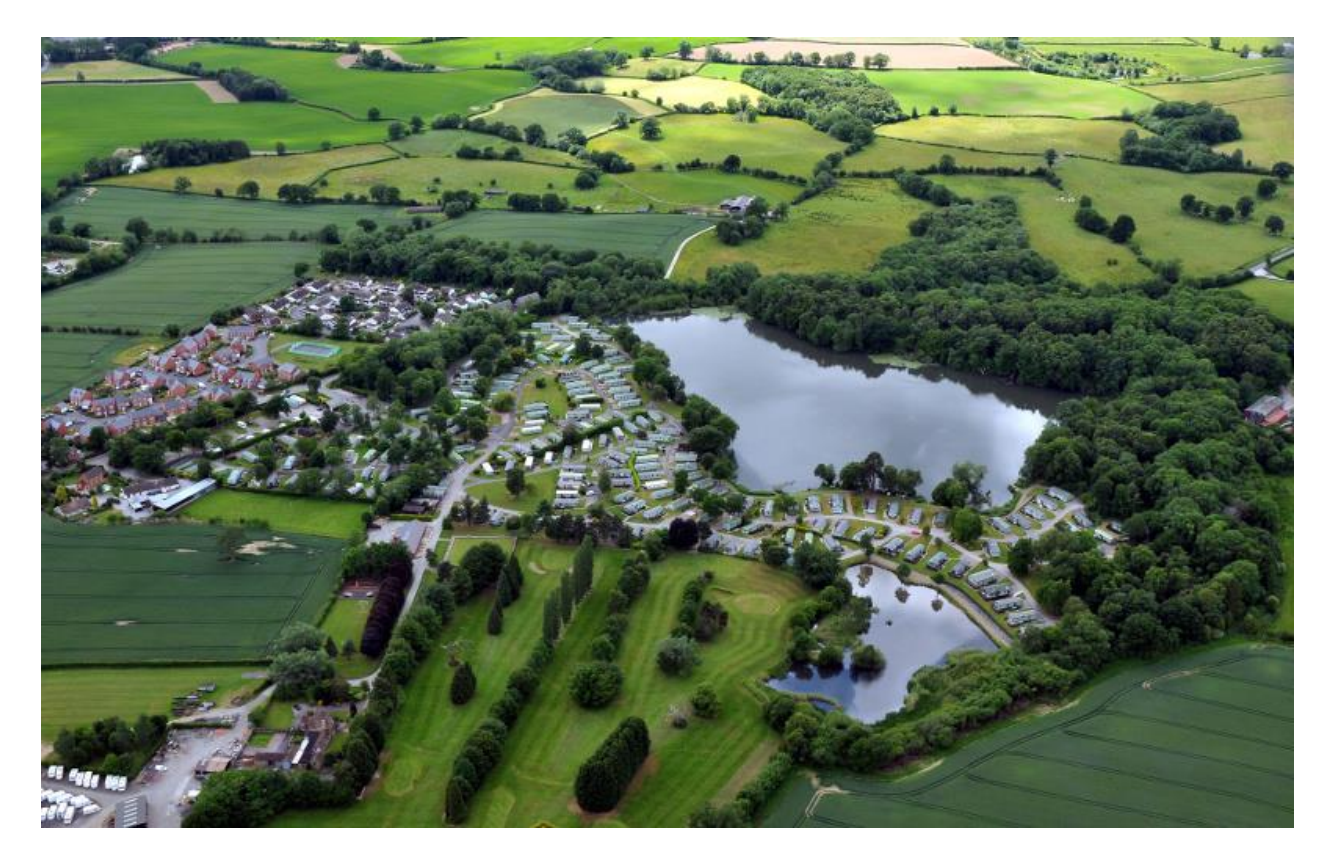
Figure 6 - Pearl Lake Caravan Park

buildings and offer poor<sup>8</sup> accommodation although provide opportunities for businesses starting up. Only the premises comprising the main Airfield site have been assessed as 'moderate' in terms of quality by Herefordshire Council. Heavy traffic travels principally through Shobdon village to the businesses in or surrounding the Airfield because of the restricted access along the road leading from Pembridge. There are highway and utility constraints which may restrict many forms of expansion beyond the present level of activity. Herefordshire Core Strategy Policy E2 would not necessarily seek to retain all these premises in employment use but with regard to the main complex on the Airfield would require certain conditions to be met should an alternative be proposed. In all instances the provision of ancillary and complementary uses which help meet the day-to-day needs of these sites and their employees and improve their attractiveness to businesses, will be permitted where they are of a scale which does not impact on the overall supply of employment land.