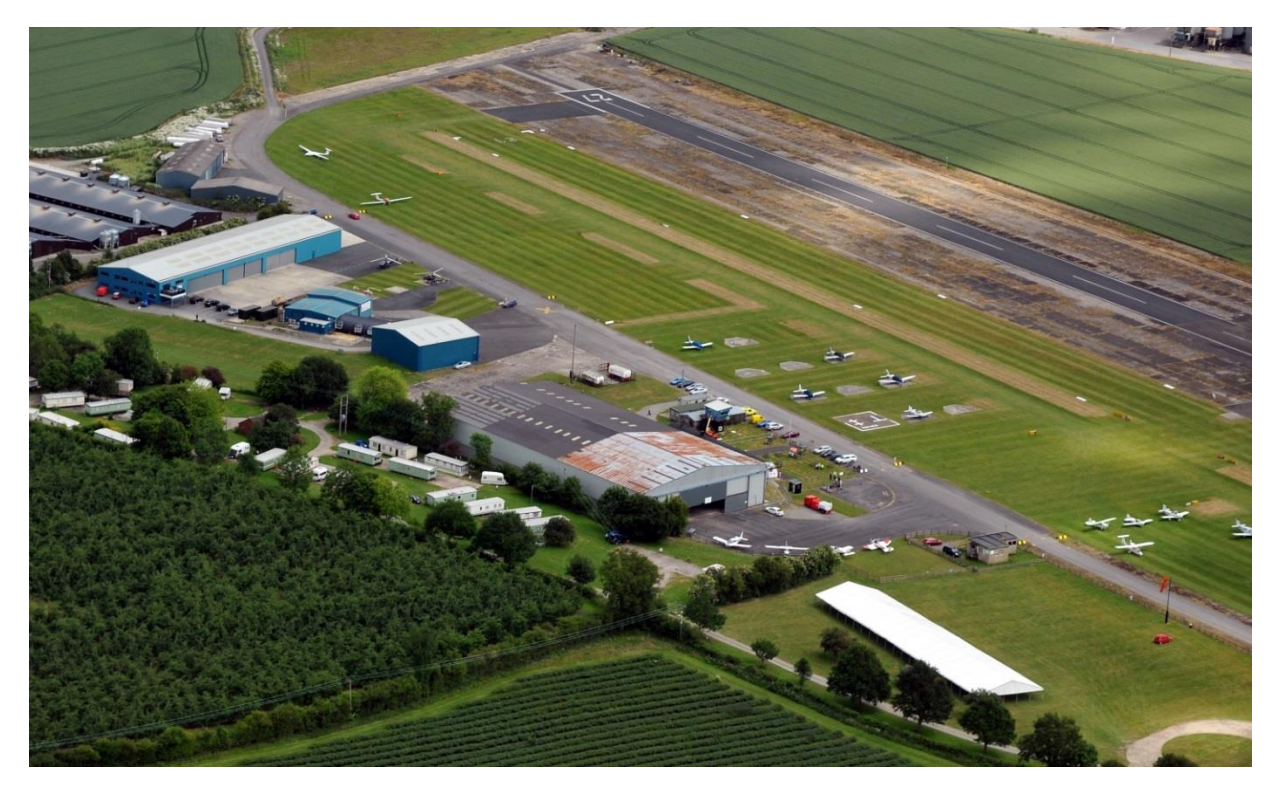
Figure 5 - Shobdon Airfield

6.3 Shobdon Airfield falls within three parishes although might benefit from a comprehensive approach at some stage to determine how it should develop. It is however associated significantly with Shobdon village and sits in the south west corner of the Parish. The aerodrome's perimeter lies approximately half a mile from Shobdon village centre along a private but relatively wide track which meets Canterbury Road at the west end of the village. Within or adjacent to the aerodrome's perimeter taxi-way there is a mixture of various leisure and recreational activities, industry, commercial operations and intensive poultry units. The airfield is used principally, although not exclusively, for pleasure flying. There is no doubt that the area has, through historical reasons, become important as an employment centre with its many buildings being used for a variety of purposes.