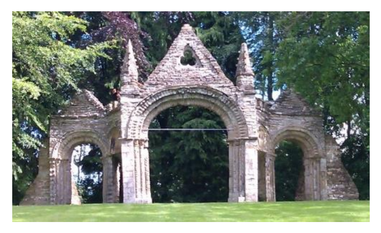
Figure 2: Shobdon Arches

upon the general direction that policies covering a number of issues might take. These have been used to inform this plan and further details of the consultations undertaken will be included in a Consultation Statement to be prepared for submission to the Inspector appointed to consider the plan after further formal community consultations have been undertaken.