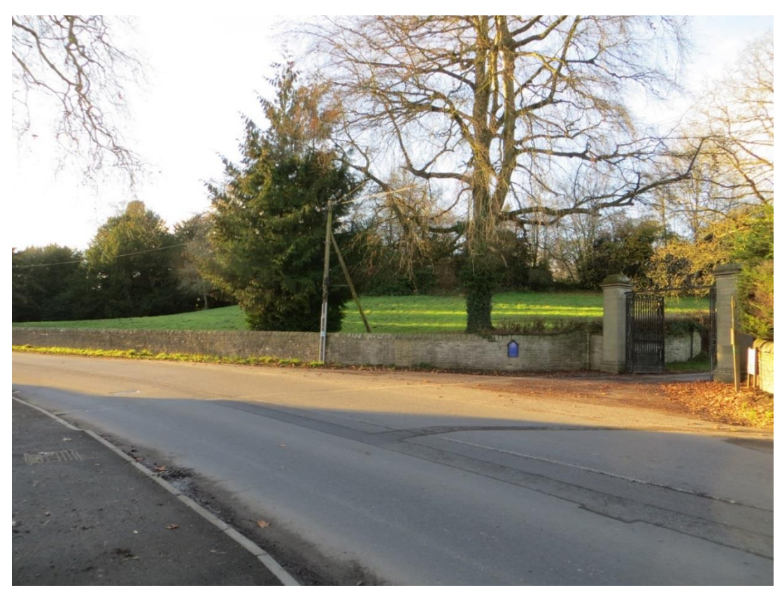
Figure 8 – Local Green Space on North side of Main Road either side of the stream passing under Shobdon Bridge

River Wye Special Area of Conservation. Ensuring the brook does not do anything that might adversely affect proposals to achieve the favourable conservation status of the River Lugg is essential. Other matters seek to increase the landscape quality and biodiversity within the Parish. Two locally important wildlife sites in addition to the Pinsley Brook and a Local Geological Site fall within the Parish. The gap created by the green space either side of the stream passing under Shobdon Bridge is protected as Local Green Space within Policy S12, for which it is defined on Shobdon Village Policies Map, and its importance to historic landscape character is described in its supporting statement. In addition, Herefordshire Council's Ecologist has identified this as a potential wildlife corridor, including its watercourse where there is good potential for protected species (bats) and nesting birds. The surrounding meadow grassland is acknowledged as potentially containing important flora species such as orchids. This adds biodiversity value to the historic landscape qualities of the area.