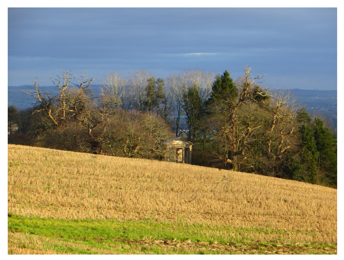
Figure 1 – The Folly, Shobdon Park

1.8 Shobdon village lies within the centre of the parish providing local facilities in terms of a village shop, post office and public house. It also contains a primary school the site of which also accommodates a pre-school group and community hall. Shobdon Airfield and premises on its periphery provide a significant number of local job opportunities ranging from engineering to tourism. The airfield also provides a range of recreational activities. Further tourism related job opportunities exist especially through Pearl Lake Caravan Park and the Mortimer Trail passes through Shobdon Wood. Agriculture remains an important activity and again utilises premises on Shobdon Airfield for bulk storage.