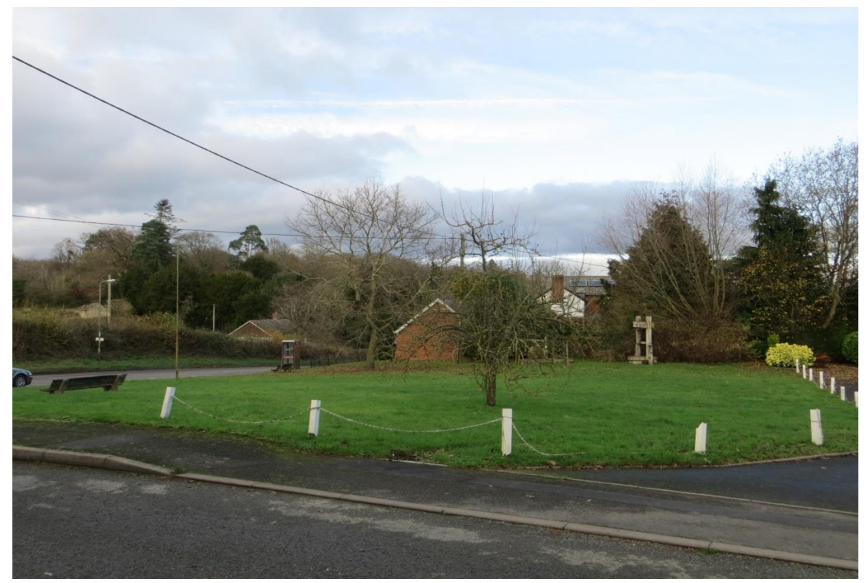
Figure 7 – Local Green Space at Hanbury Green