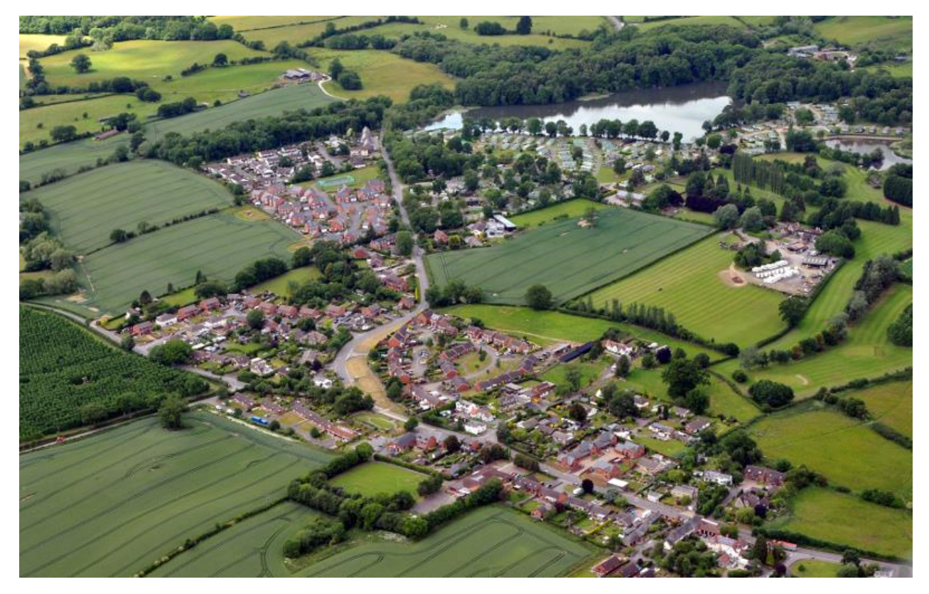
Figure 4 – Shobdon Village

3.5 Providing for local housing needs is similarly a high priority, and the intention is that all the community's needs should be catered for. Herefordshire Core Strategy indicates that a range of house types and tenures should result from its proposals for new homes. Nowhere is this more crucial than in the rural areas where developers tend to seek permission for larger more expensive dwellings. The approach to new housing seeks to provide for the wider needs of the community and enable new residents to contribute positively to its overall health and wellbeing.