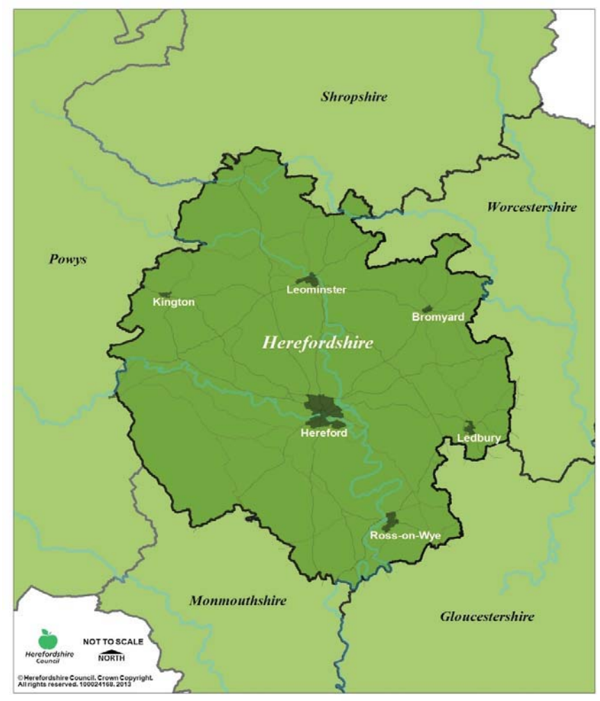
Figure 2.1 Herefordshire and surrounding counties

Reproduction of Figure 2.1, Herefordshire Core Strategy