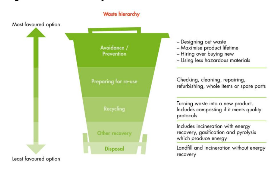
Figure 3.1 Waste Hierarchy

3.2.4 The Core Strategy vision is focussed on achieving sustainable development that is based upon success across society, economy and the environment; it also seeks to achieve self-reliance and resilience. These are all principles that are readily transferable to minerals and waste.