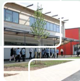
▲ Whitecross High School

On the democracy front, Hereford's first Youth Council was sworn in and has embarked on a programme to improve young people's involvement in county decision-making.