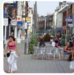
▲ Refurbishment of Eign Gate

The Council maintains a full three-year rolling capital programme linked to the council's strategic plans and estimated sources of funding.