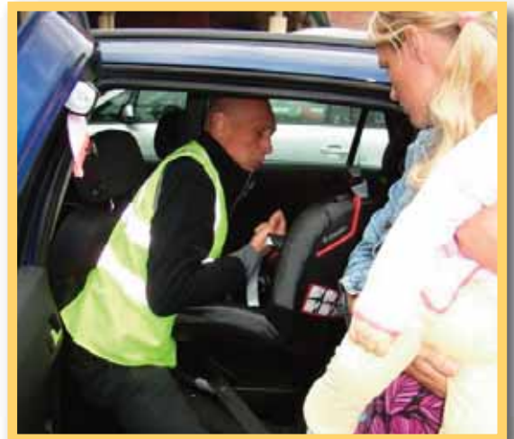
Keeping baby safe

November saw a pilot Child Pedestrian Training at St Pauls Primary School. Training took place one afternoon a week over 3 weeks. The first session was theory only, the second session was a practical, walking an assessed route, and the third was an assessed practical. If successful once assessed the road safety team will be offering the training to other schools where it can be safely carried out.