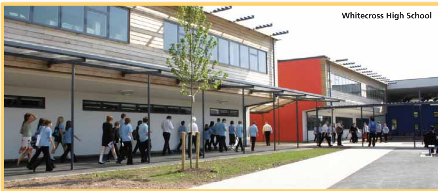
Whitecross High School

Following this short pilot a month long pilot will now enable many schools to show just how useful video conferencing can be in educational settings. It will allow management meetings to take place remotely, and for teachers to teach children in more than one place at once. It also allows experts to communicate with classes of children without physically going to visit them.