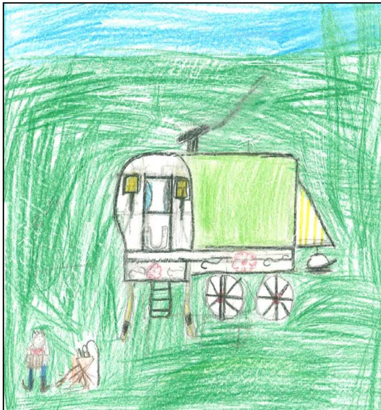
(The Caravan Site, Manor House Lane)

REVISED FINAL REPORT JULY 2008 WITH AMENDED PITCH FIGURES FOR HEREFORDSHIRE